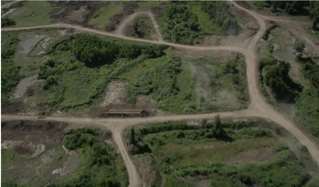
Figure 8-1.-- Dirt-Road Course Example

b. Cross-Country Course . Figure 2 illustrates a possible cross-country course established at a site near the licensing activity. This course should be 1-2 miles in length and should include the following terrain features: