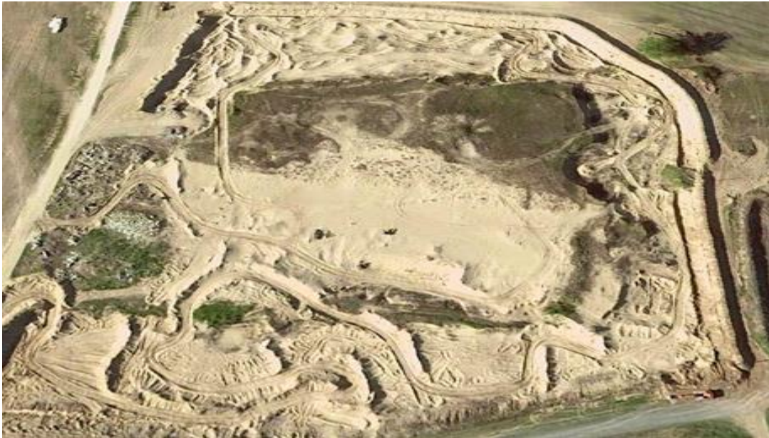
Figure 8-2.-- Cross-Country Course Example

c. Combination Dirt-Road/Cross-Country Course . Figure 3 depicts a possible combined route. This route should retain as many terrain features of both courses as possible.