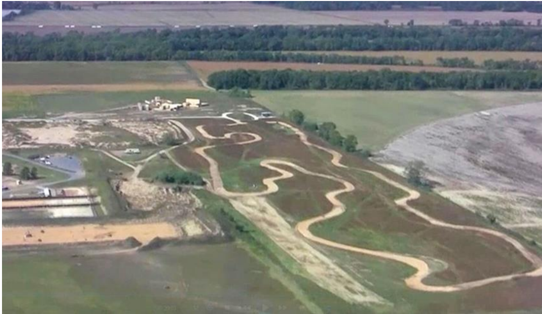
Figure 8-4.--Permanent Driving Range Example.

d. Permanent Driving Range . Figure 4 illustrates a driving range that is capable of accommodating a variety of vehicles. This type of facility should be constructed only when large numbers of applicants are to be licensed and when access to a Dirt-road/Cross-Country Course is limited or unavailable altogether.