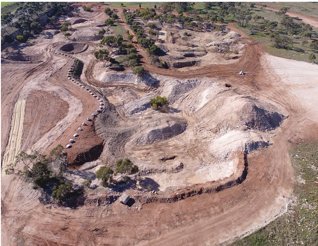
Figure 8-3.-- Combined Dirt-road/Cross-Country Course Example

c. Combination Dirt-Road/Cross-Country Course . Figure 3 depicts a possible combined route. This route should retain as many terrain features of both courses as possible.