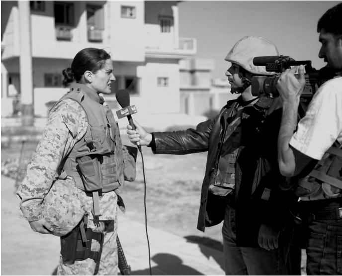
Figure 4-5. Public Affairs.