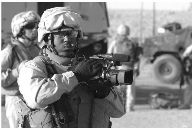
Figure 1-2. Motion Imagery (Video).