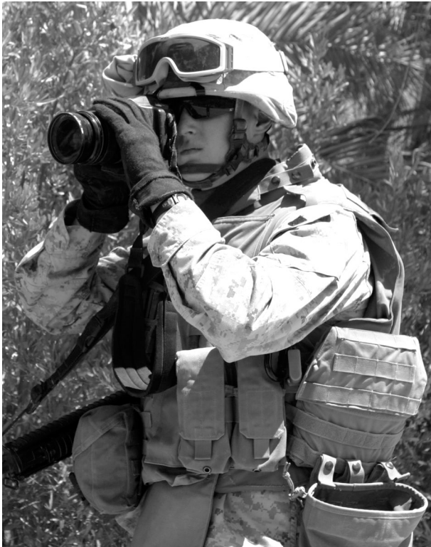
Figure 1-1. Still Photographic Imagery.