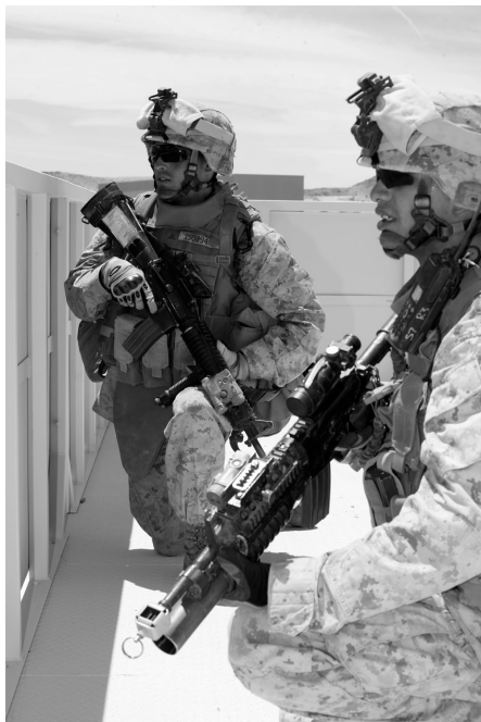
Figure 4-6. Training.