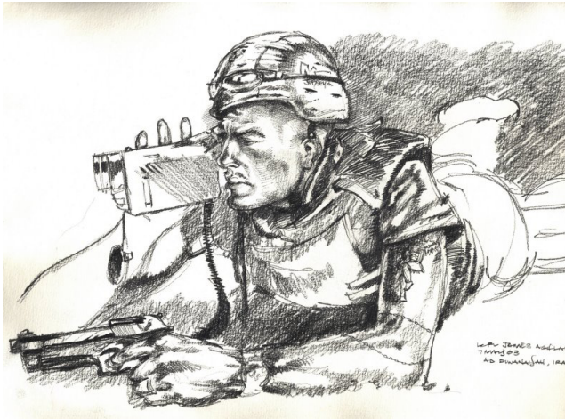
Figure 1-4. Combat Art.