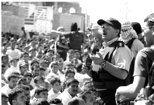
Figure 4-4. Peacekeeping Operations.

One of the five pillars of IO is PSYOP. Combat camera is an invaluable resource to support efforts to shape the battlefield and execute a PSYOP campaign plan. Psychological operations are planned operations that convey selected information and indicators to foreign audiences to influence their emotions; motives; objective reasoning; and, ultimately, the behavior of foreign governments, organizations, groups, and individuals. A