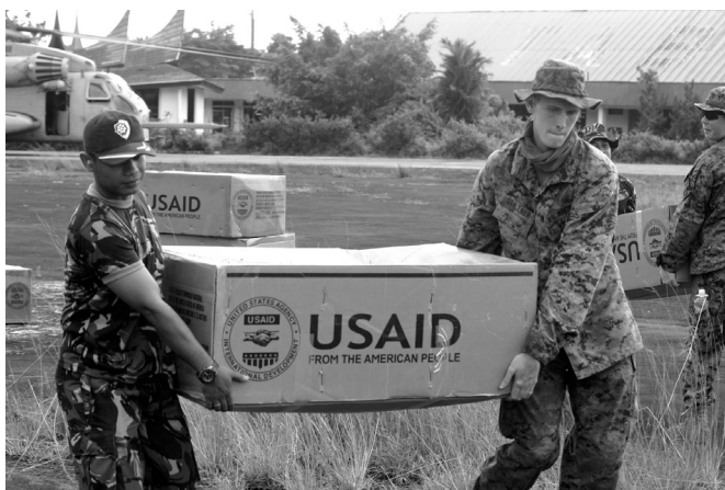
Figure 4-3. Foreign Humanitarian Assistance and Disaster Relief.

Many factors are unique to counterdrug operations, such as a high degree of interagency and international coordination. Most significantly, the legal and law enforcement aspects are extremely sensitive. Commanders use COMCAM imagery to familiarize their Marines with terrain features, show facilities for use in planning command posts, document seizures and evidence, and protect US forces from legal reprisal.