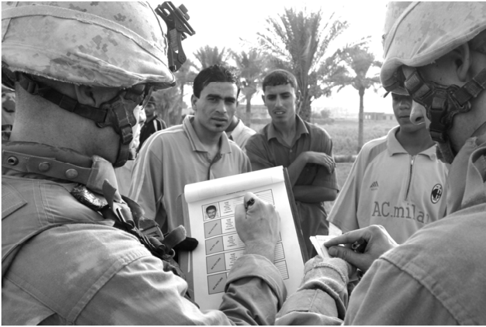
Figure 4-1. Information Operations.