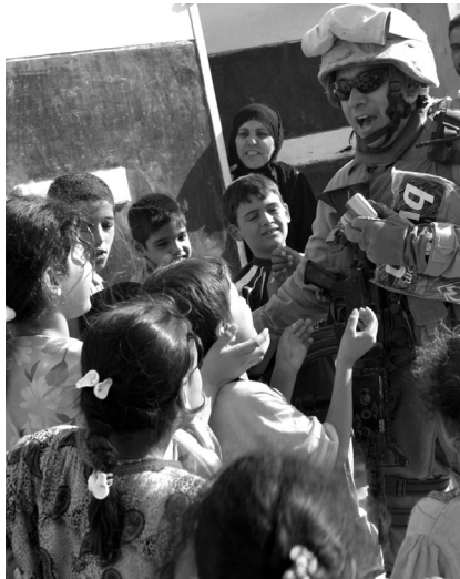
Figure 4-2. Civil-Military Operations.

Combat camera can be attached to the civil engineer battalion to document conditions before and after civil engineer battalion