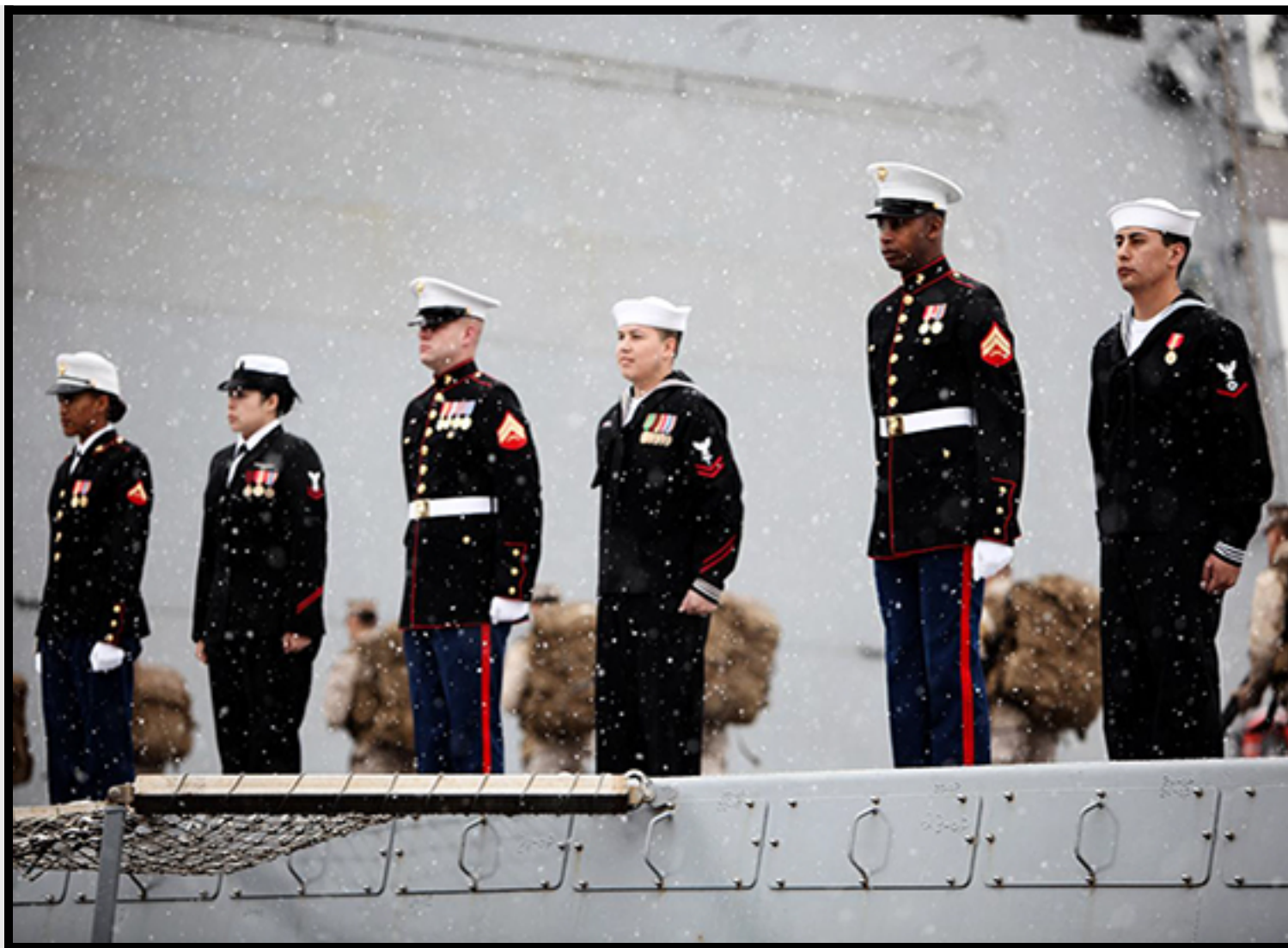
Sailors and Marines man the rails as the ship is brought to life during the commissioning of San Antonio-class amphibious transport dock ship USS Anchorage (LPD 23) at the Port of Anchorage. More than 4,000 people gathered to witness the ship's commissioning in its namesake city of Anchorage, Alaska. Anchorage, the seventh San Antonio-class LPD, is the second ship to be named for the city and the first U.S. Navy ship to be commissioned in Alaska.