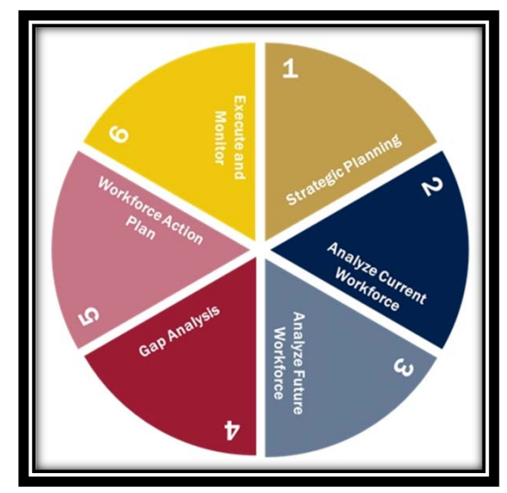
Figure 2-2.--Command-Level Strategic Workforce Planning Process Map

a. CLSWP is the process for identifying, acquiring, developing, shaping and retaining the workforce needed for a command to accomplish its mission, functions and tasks. As Figure 2-2 demonstrates, the command-level process is a cyclic process divided into six primary steps. These steps and the desired outcomes of each are defined in the following paragraphs.