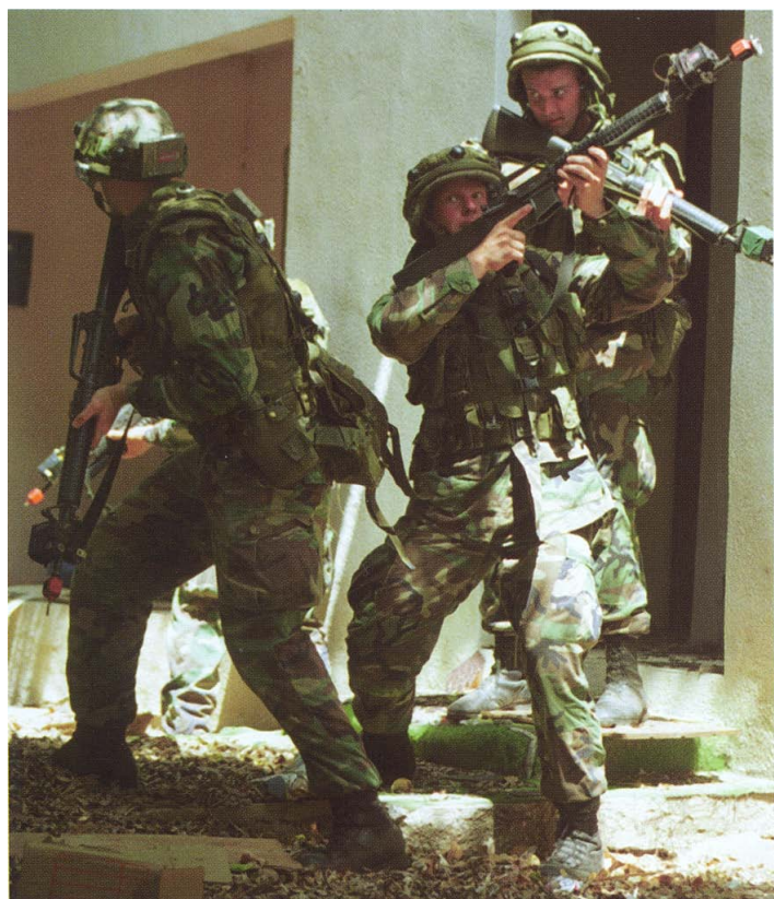
Marines of the 1st Battalion, 24th Marines conducted Military Operations on Urbanized Terrain (MOUT) in Aruba.