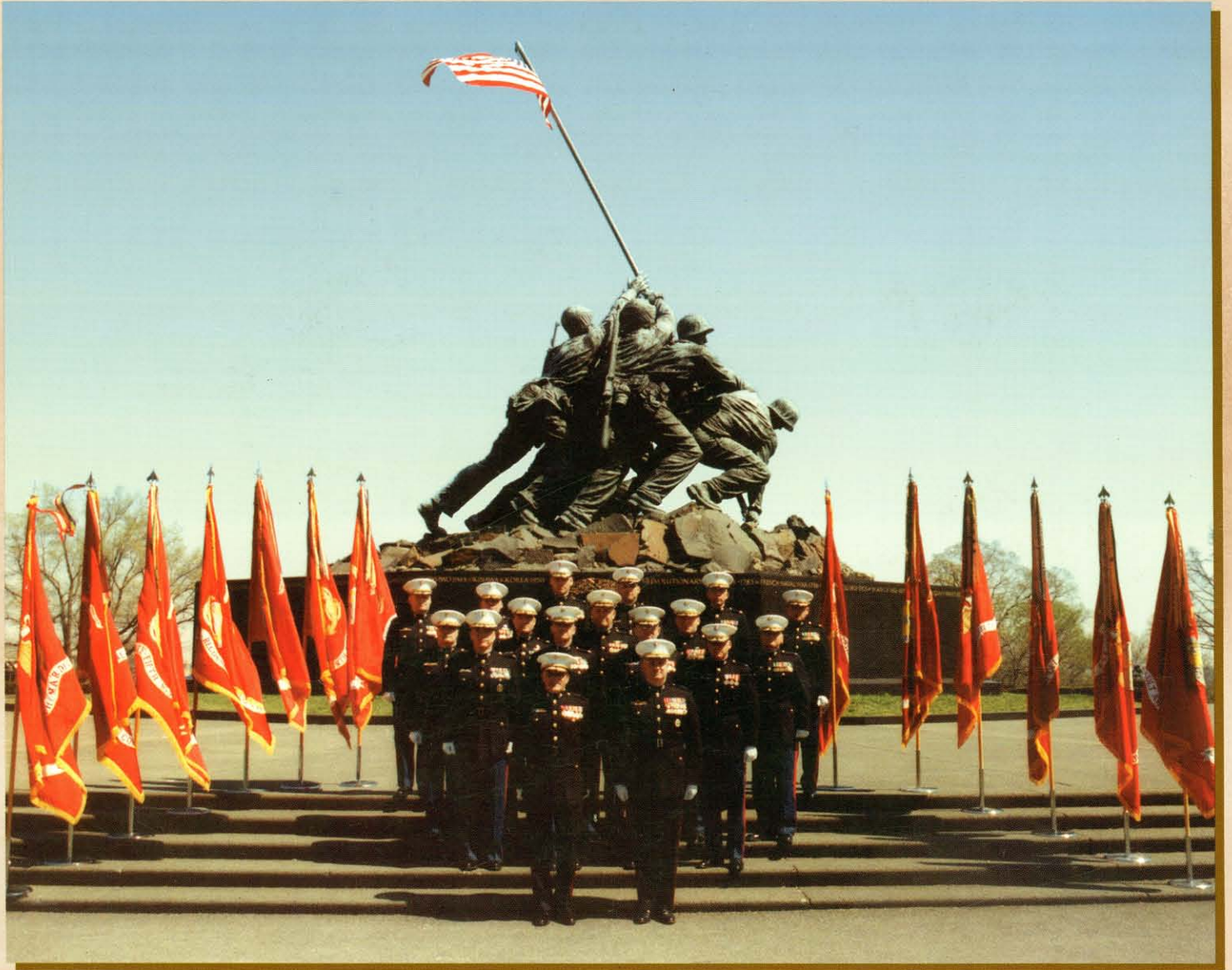
The 4th Division Commanders 2000