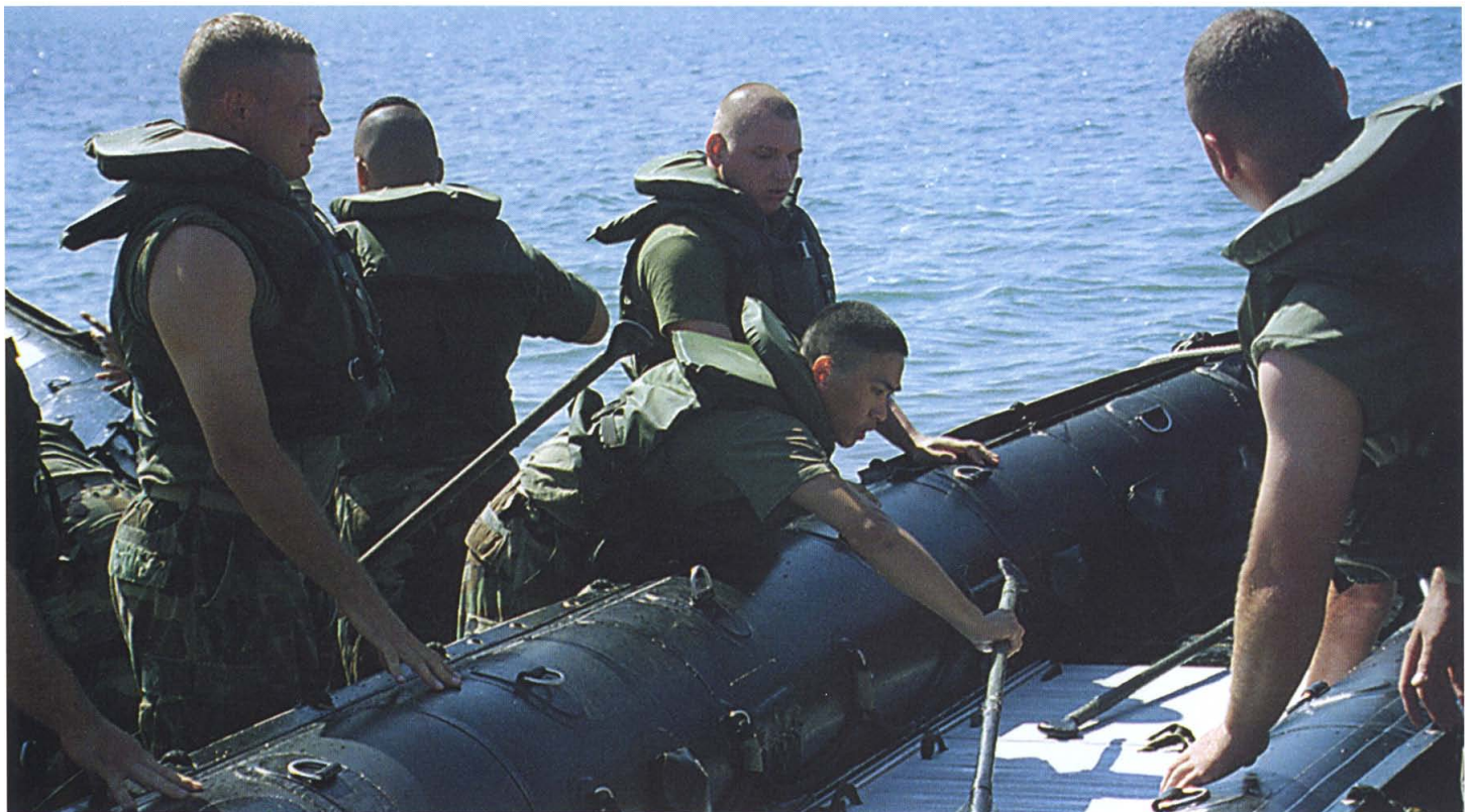
Headquarters Company Marines from the 24th Marine Regiment, Kansas City, MO, prepare for small boat training with the F470 Zodiac Combat Rubber Raid Craft during Amphibious Orientation Training '99 at Naval Amphibious Base Coronado, CA.