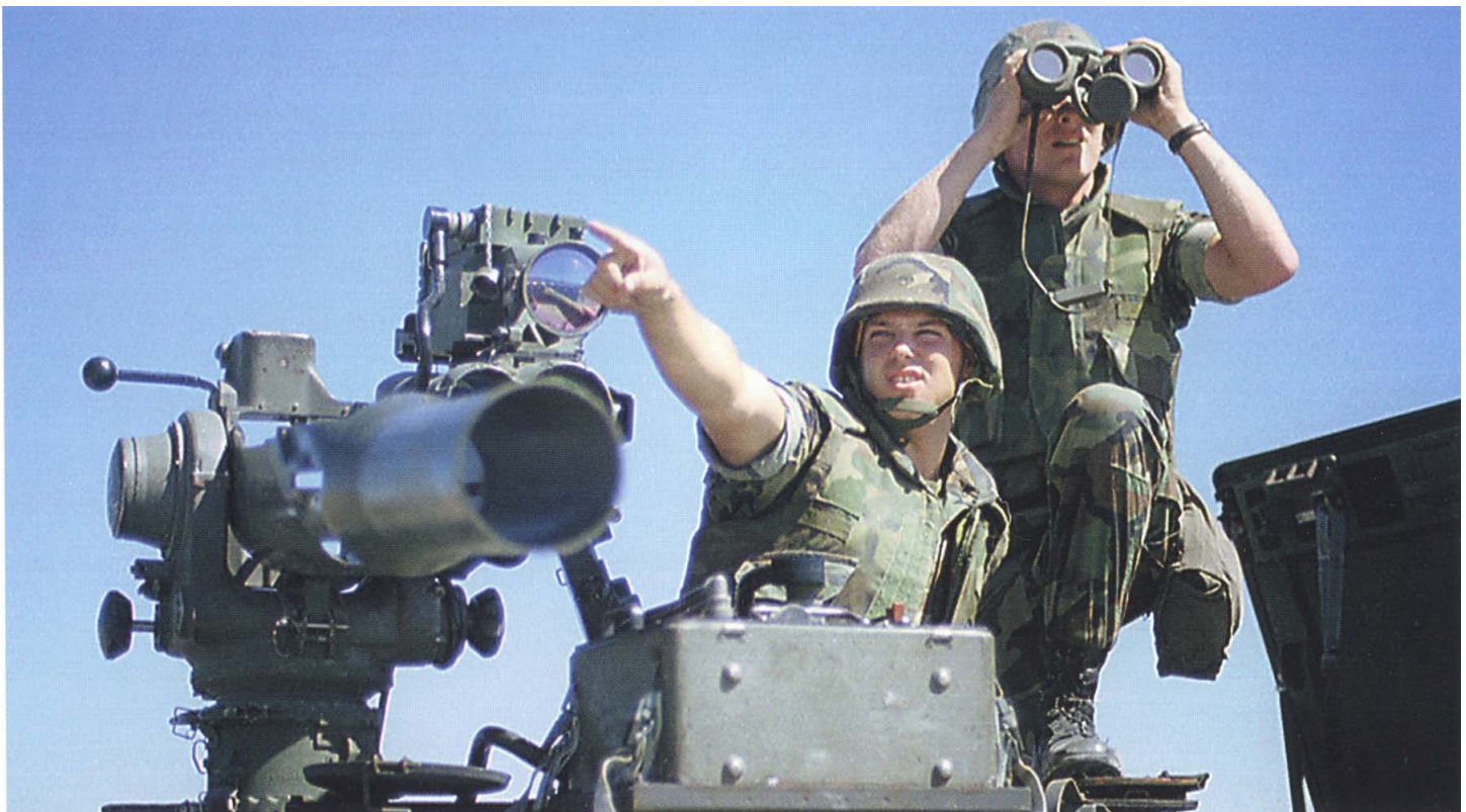
Marines of TOW Platoon, 24th Marine Regiment watch a TOW missile fly down range at 600 mph with suppressive fire all around the vehicle.