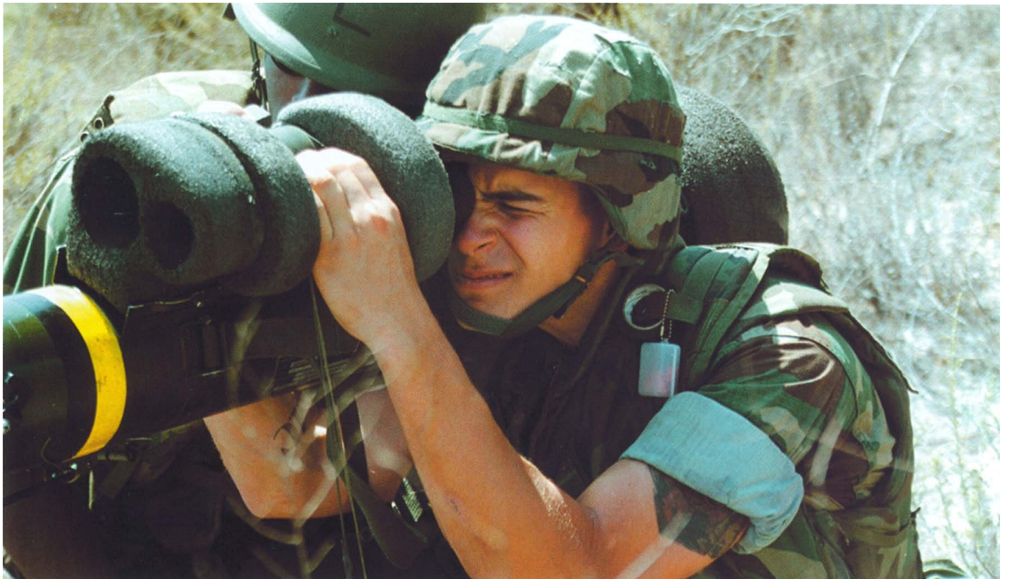
Marines of Anti-Armor Platoon, Weapons Company, 1st Battalion, 24th Marine Regiment, 4th Marine Division deploy the Dragon weapon system during Summer Thunder '99 aboard Camp Pendleton, CA.