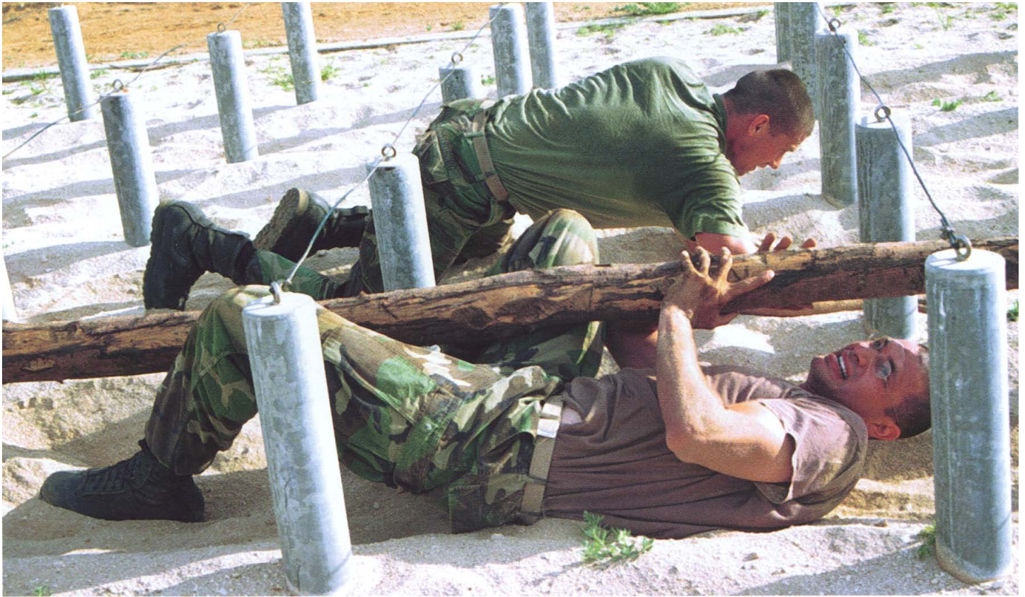
Leathernecks maneuver through an obstacle course at the Royal Netherlands Marine Base in Aruba.