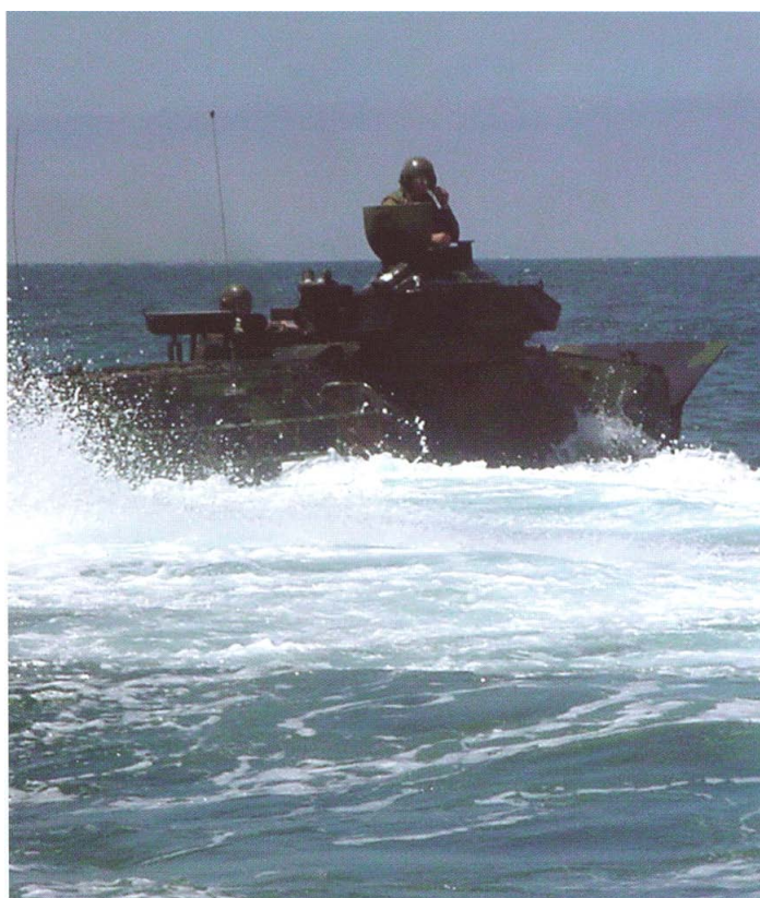
Assault Amphibian Vehicles from 3rd Plt, B Co., 4th Assault Amphibian Battalion surf the waves.