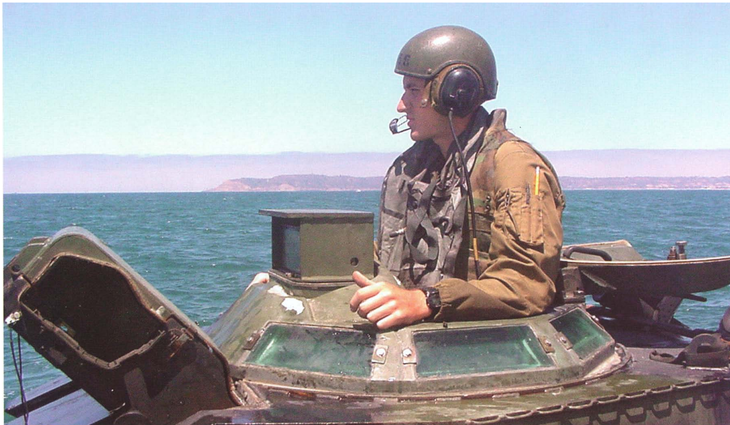
AAVP7A1 Assault Amphibian Vehicles from 3rd Platoon, Company B, 4th Assault Amphibian Battalion from Galveston, TX, take on the waves of the pacific ocean during Amphibious Orientation Training in Coronado, CA.