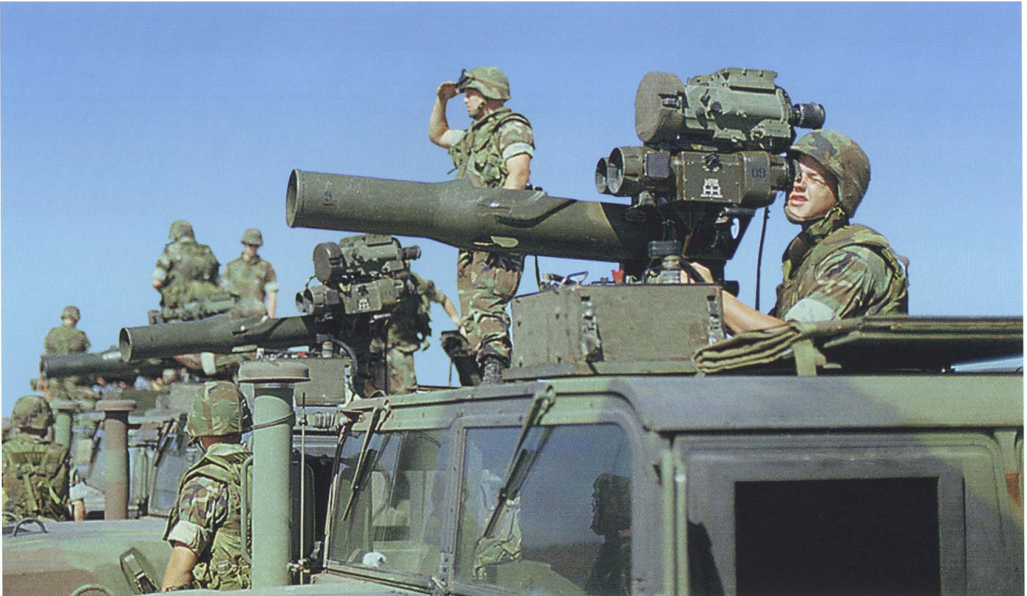
TOW Platoon from the 24th Marine Regiment acquire a target before firing a TOW missile during Amphibious Orientation Training at Camp Pendleton, CA.