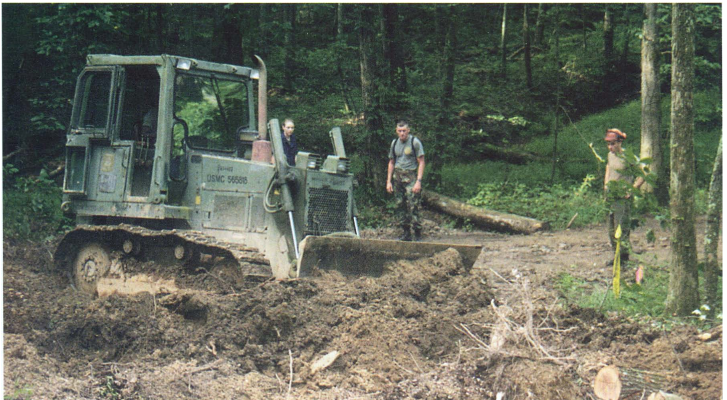
Company D, 4th CEB build a road as a community service project during annual training in Rookwood, TN.