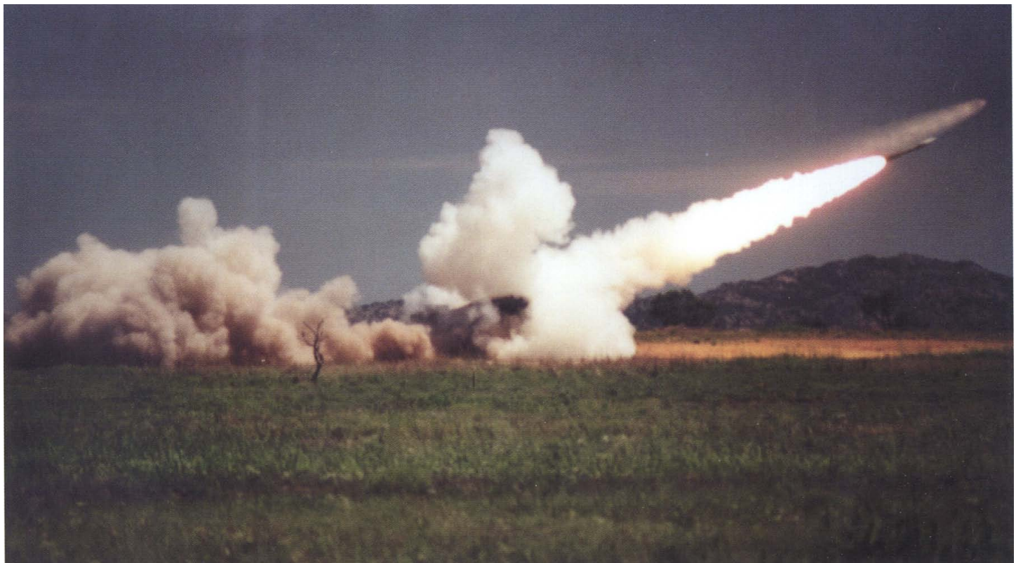
14th Marines fire MLRS down range at Ft. Sill, OK.