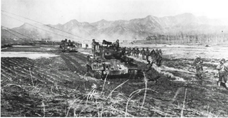
1stMarDiv Historical Diary Photo Supplement, Mar51

Tank and infantry teams move to the flanks of the advancing Marine column north of Hoengsong. The cold weather and sticky mud were as difficult to overcome as was the enemy during Operation Killer.