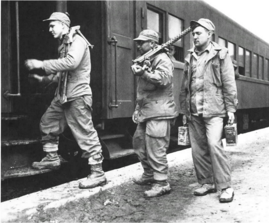
National Archives Photo (USMC) 127-N-A7274

A Marine light machine gun team boards a train for the trip from Pohang to Chungju in central Korea. The 1st Marine Division was to be positioned astride what LtGen Matthew Ridgway considered to be the logical route for the expected enemy counterthrust.