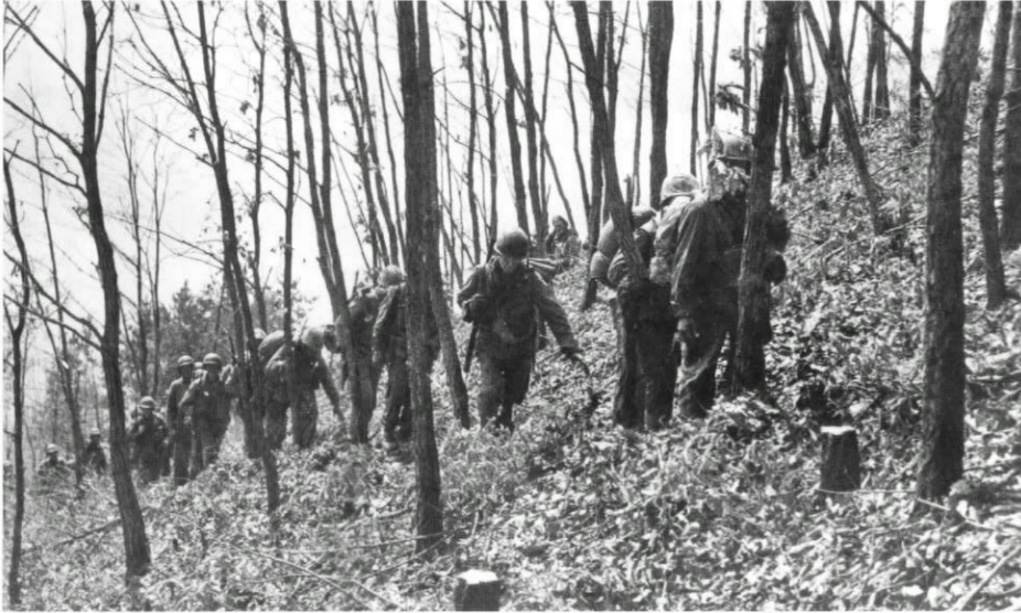
1stMarDiv Historical Diary Photo Supplement, Mar51

North of Hoengsong, Marines move up into the hills. Stamina and physical conditioning were important during the unending series of hill fights that led back to the 38th Parallel.