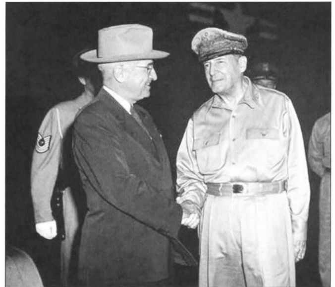
National Archives Photo (USA) 111-SC353136

The roots of the dispute began almost as soon as the United States became enmeshed in Korea. MacArthur bristled over what he considered political meddling in military affairs in August 1950, and then more frequent-