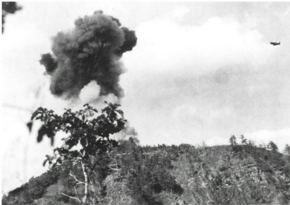
1stMarDiv Historical Diary Photo Supplement, Jan-Feb51

A Marine Corsair circles after delivering napalm upon a suspected enemy position near Wonju in central Korea. The controversial breakup of the Marine air-ground team by Fifth Air Force in 1951 remained a touchy and unresolved issue throughout the rest of the Korean Conflict.