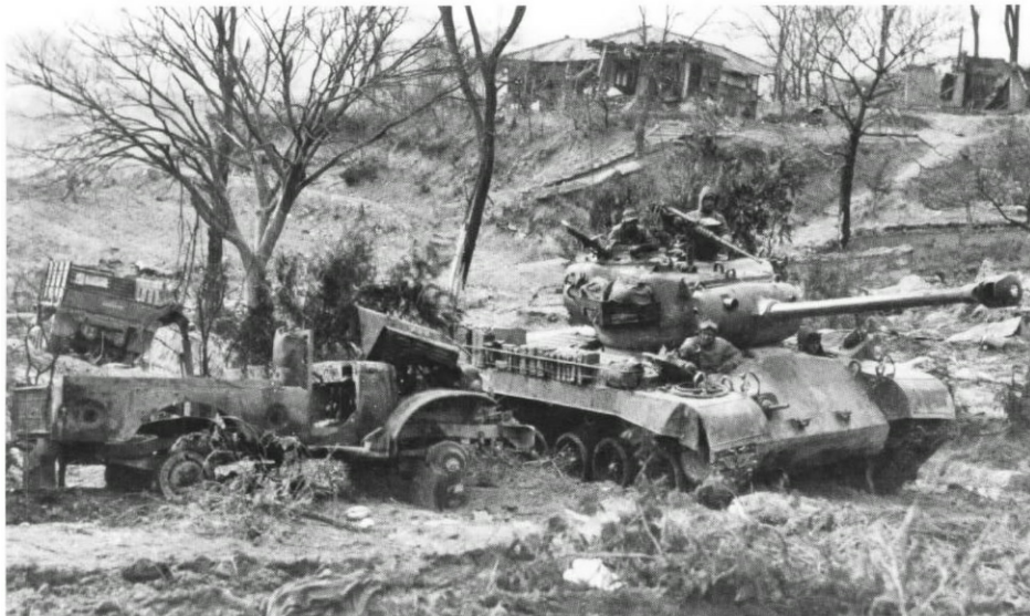
1stMarDiv Historical Diary Photo Supplement, Mar51

A Marine tank pushes through the wreckage from ambushed U.S. Army units, which clogged the road to Hoengsong. Bad weather, poor roads, and supply difficulties held up the Marines more than enemy resistance during the spring of 1951.