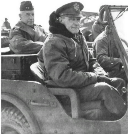
National Archives Photo (USA) 111-SC361108 MajGen William M. Hoge, USA, seated in front, was sent out to relieve MajGen Oliver P. Smith, who had been given temporary command of IX Corps.

tained contact with the 6th ROK Division. The assault battalions advanced about a half-mile before they came under heavy mortar and automatic weapons fire, then were completely halted by a minefield. With the main attack stalled and darkness closing in, it was decided to wait until the following day to finish the job.