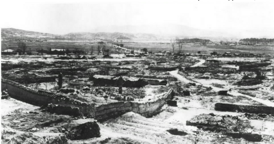
1stMarDiv Historical Diary Photo Supplement, Mar51