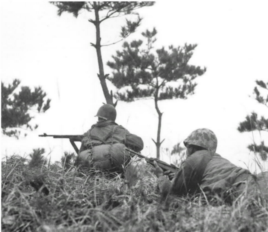
Department of Defense Photo (USMC) A6946

An automatic rifleman supported by another Marine with a carbine fires into a Communist-held position. Because of its great firepower, the Browning Automatic Rifle was the most vital weapon of a Marine fire team.