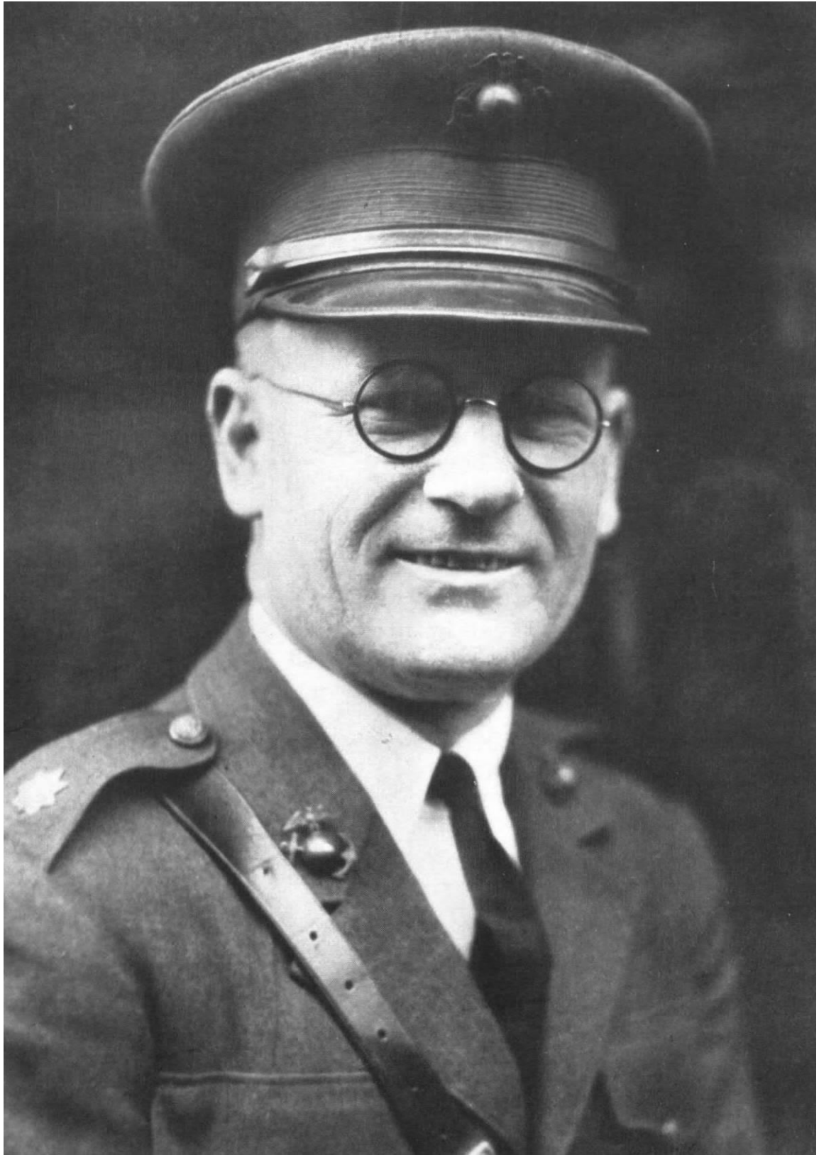
Lieutenant Colonel Edwin North McClellan, USMC