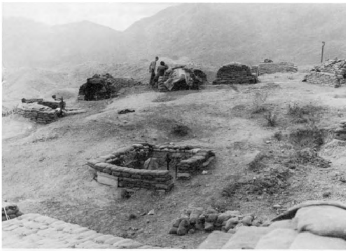
About one mile north of Fire Support Base Ross in February, 1st Division Marines man a high-altitude, well-bunkered 60mm mortar installation with a long view looking west from Hill 218.