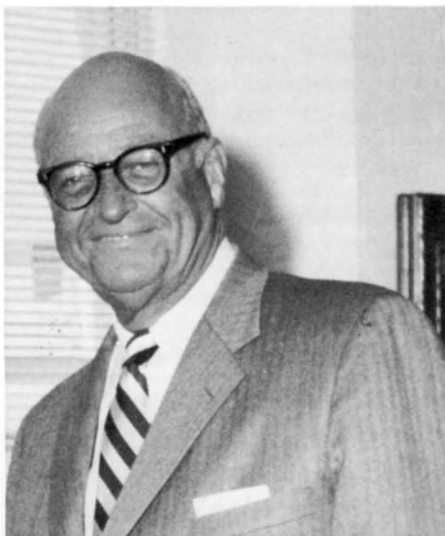
BGen Roosevelt in 1979

In February 1942, Maj Roosevelt was assigned executive officer of the 2d Separate Battalion, 2d Marine Division, which was redesignated that month as the 2d Marine Raider Battalion, commanded by LtCol Evans F. Carlson. He took part in the Makin Island raid in August 1942, for which he was awarded the Navy Cross: "... risking his life, over and beyond the ordinary call of duty, Maj Roosevelt continually exposed himself to intense machine gun and sniper fire to insure effective control of operations from the command post. As a result of his successful maintenance of communications with his supporting vessels, two enemy surface ships were destroyed by gunfire. Later, during evacuation, he displayed exemplary courage in personally rescuing three men from drowning in the heavy surf . . ."