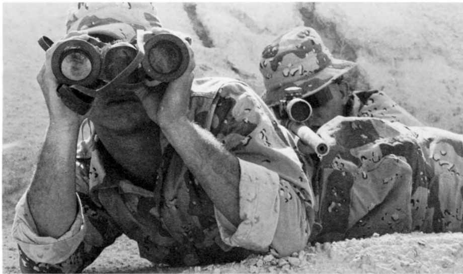
Snipers from the 1st Marine Division keep a wary eye on Iraqi Army troops across the Saudi Arabia-Kuwait border during the tense weeks of Operation Desert Shield. The Marine Corps announced the commitment of 45,000 troops in mid-August.

22 Aug —President Bush ordered the first mobilization of U.S. military reserves in 20 years and declared the call-up “essential to completing our mission” of thwarting Iraqi aggression in the Persian Gulf. Most of those summoned to active duty in the initial mobilization were Army Reservists.