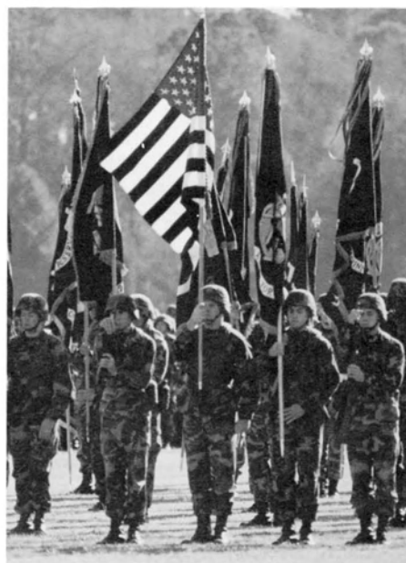
II Marine Expeditionary Force, behind its colors, musters at Camp Lejeune for pre-deployment review by the Commandant.

20 Apr—7 May —Marines of the 28th Marine Expeditionary Unit participated in Exercise Ocean Venture 90 in the Caribbean. The five-Service joint task force was designed to demonstrate U.S. power projection and rapid deployment capability in the Caribbean. Unlike Exercise Ocean Venture 88 that involved dozens of ships and 40,000 military personnel, the 1990 exercise involved only 12 ships and 14,000 troops—a result of budget cuts curtailing large-scale joint exercises.