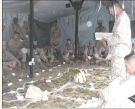
TS Company Marines receive a convoy order prior to conducting convoy operations while at Fort Bragg.