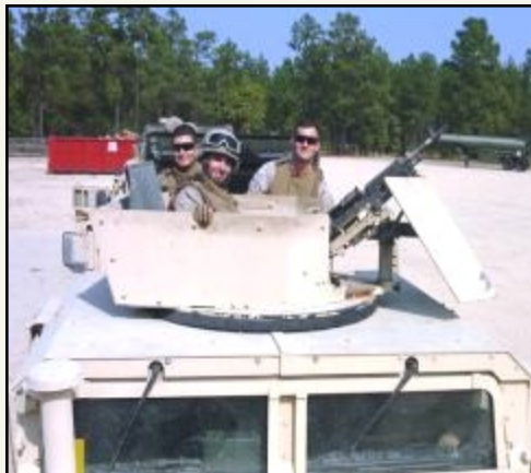
Engineer Company Marines prepare to begin their convoy live fire range. This was just a small part of the training that took place during CLB-8's Battalion FEX II in Fort Bragg.