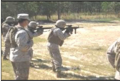
Marines conduct an EMP shoot during training at Fort Bragg during Battalion FEX II.

went to Fort Bragg, NC, to conduct the last battalion exercise before we depart for Mojave Viper. We left October 6, 2010, a day that dawned crisp and brilliant as a portent of things to come. For nearly the entire exercise, we were blessed with brilliant weather, resplendent bright blue skies, gentle winds, and a persistent sun determined not to relinquish its grasp on summer. The