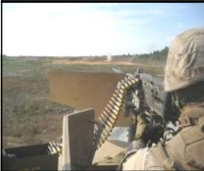
A Security Gunner takes part in a live fire exercise on Range 63 during Battalion FEX II in Fort Bragg, NC.