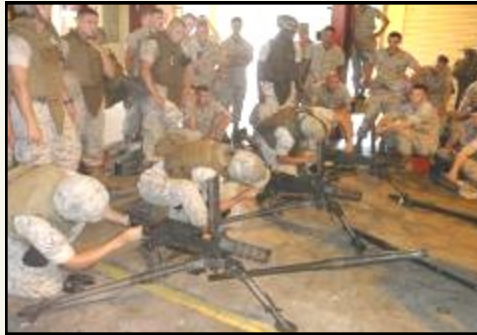
TS Company Marines race each other on assembly and disassembly of their weapons during a Machine Gun Rodeo.

In September, the company completed numerous pre-deployment training packages that focused on the platoon, company, and battalion level skills. At the battalion level, the company went to Camp Davis South and focused on integrating the company with the other parts of the battalion as they prepared and executed their convoys.