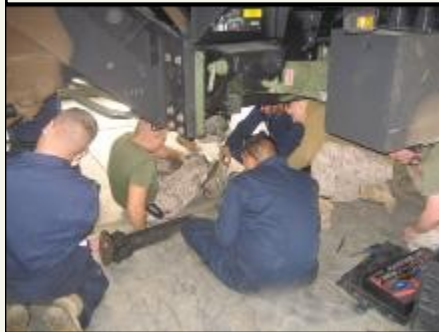
Maintenance Marines conduct repairs on a vehicle during Battalion FEX II in Fort Bragg, NC.

Marines proved to the company staff, and battalion as a whole, their incredible professionalism and their eagerness to improve their skills. Due to the diversity of Support Company, numerous training events occurred concurrently during this field exercise. The Landing Support Marines travelled to Cherry Point to learn and practice moving personnel and