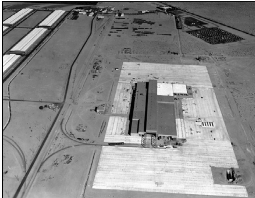
The Central Repair Shop at the Yermo Annex aboard Marine Corps Logistics Base Barstow during its construction prior to the April 1961 opening of the Marine Corps' largest enclosed structure. The more than one million square foot facility cost $7 million and took two years to build. This year celebrates the 50th anniversary of MCB.