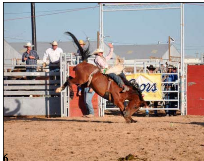
(Left) The Barstow Boys and Girls Club Professional Rodeo Cowboys Association Rodeo Stampede was held at the Lt. Col. Robert A. Lindsley Base Stables which featured many crowd-pleasing rodeo events such as bareback riding, saddle bronc riding, tie-down roping, mutton bustin' and much more.