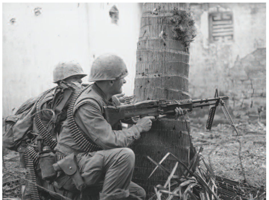
Department of Defense (USMC) Photo A371377