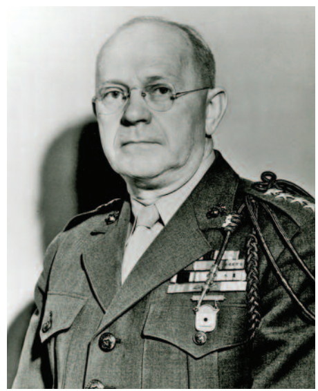
Gen Thomas Holcomb, Commandant of the Marine Corps and Ambassador to the Republic of South Africa.

Like all good ideas, the concept of Marines was revisited during the period of South Africa's Border War from 1966 to 1989. During the conflict, the South African Army and Air Force took pride of place and budget. Any landing operations were conducted by the Army and Special Forces as the only had submarines, Navv minesweepers, patrol gunboats, frigates, and support ships. As the conflict expanded down the west and east coasts, the nationalist and communist threats offered exposed flanks. When the need for increased naval participation was recognized, it was felt that an amphibious force could be used for both base security and amphibious operations. In 1979, the South African Navy decided to establish a Marine Brigade. With somewhere near 1,000 men, it was more like a reinforced battalion landing team. Augmentation from the South African Army was planned to bring the brigade to full strength. At the time, the South African Navy had thir-