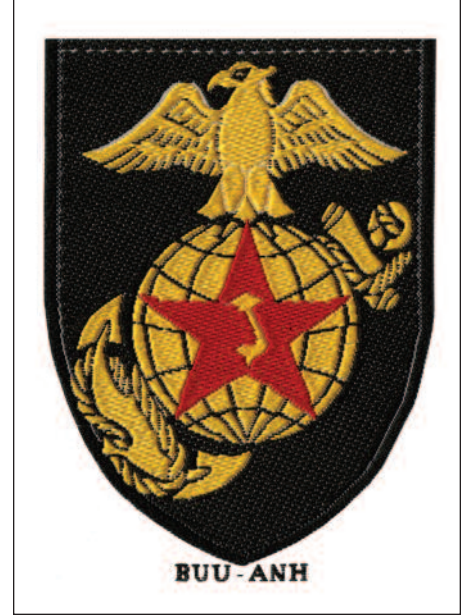
Insignia courtesy of the author. Vietnamese Marine Corps brigade insignia worn on the shoulder of the "tiger stripe" utility uniform. While the eagle, globe, and anchor are similar to the U.S. Marine emblem, the scarlet and gold star and silhouette showed both North and South Vietnam. The shield was in black, the color of a "death volunteer."

An examination of some of the corporeal aspects of the Vietnamese Marines is useful before considering their performance. This is the "soldier's load" in more than just material because it reflects the corporate tradi-