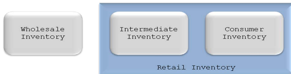
Figure 1-1.--Inventory Levels of Supply.

4. Inventory Levels of Supply . There are two major inventory levels of supply within the Marine Corps: wholesale and retail.