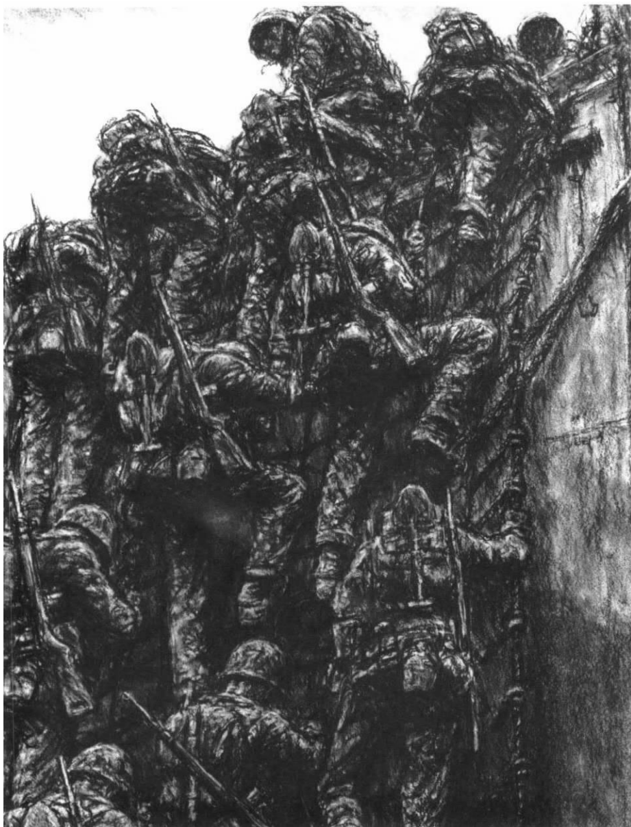
U.S. Navy Combat Art Collection