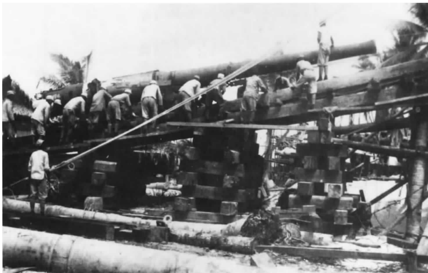
Marine Corps Personal Papers, Boardman Collection

Japanese Special Naval Landing Force troops mount a British-made, Vickers eight-inch naval cannon into its turret on Be-