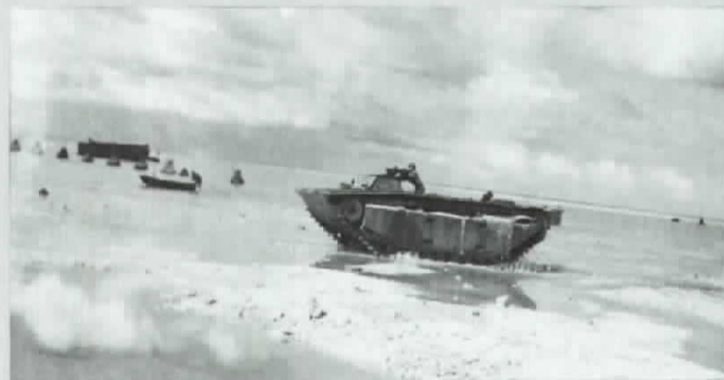
Department of Defense Photo (USMC) 63646

The LVT(A)2 ["A" for armored] requested by the U.S. Army was a version which saw limited use with the Marine Corps. The LVT(A)2 had factory-installed armor plating on the hull and cab to resist heavy machine gun fire. The new version appeared identical to the LVT-2 with the exception of armored drivers' hatches. With legitimate armor protection, the LVT(A)2 could function as an assault