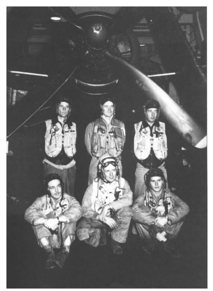
National Archives Photo (USN) 80G-428028

This somewhat confusing situation had the added facet that several now-enlisted NAPs had been commissioned lieutenants in World War II. However, after mus-