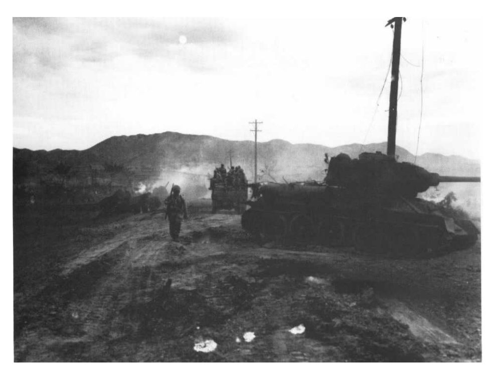
Department of Defense Photo (USA) SC348504 A curious Marine passes three destroyed North Korean T-34 tanks five miles east of Inchon. The rocket-laden Corsairs of VMF-214 knocked out the tanks, part of a group of six ordered to break-up the landing.

led the pilots to believe that all six tanks had been destroyed, so they switched to other targets in the beachhead area.