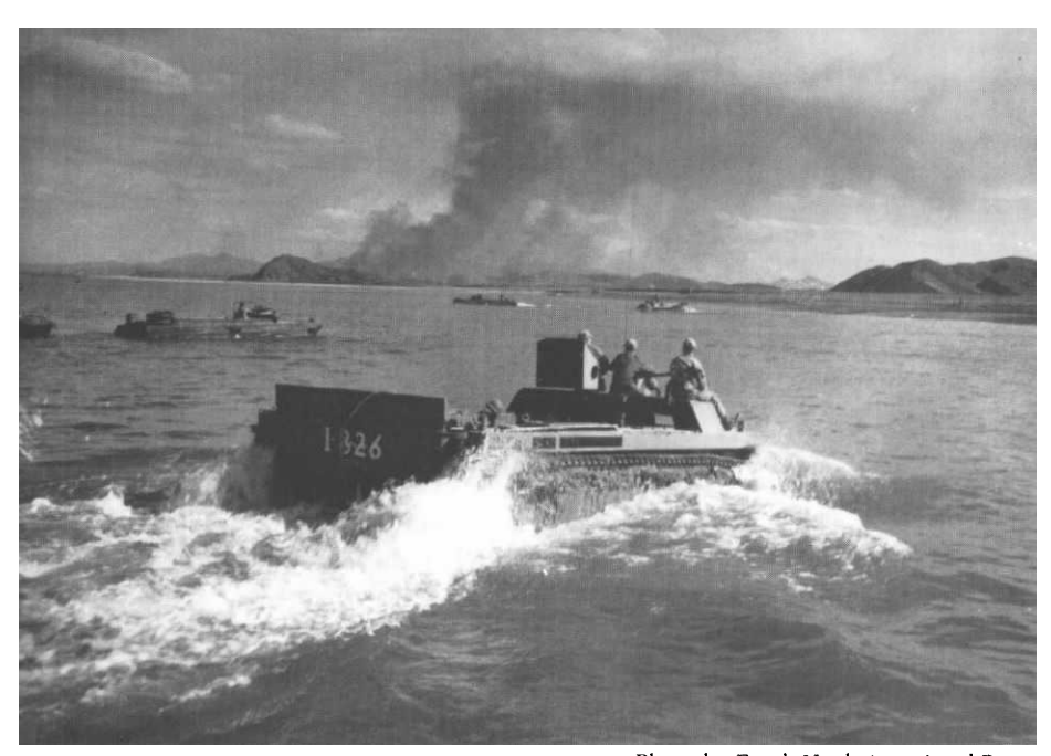
Marine amphibious tractors plow across the muddy Han River as the planes of Marine Aircraft Groups 12 and 33 provide close support for the 1st and 5th Marines in their assault toward the South Korean capital.

abortive attempt during the night of 19 September; the 3d Battalion accomplished it during daylight hours on the 20th. Four Corsairs of VMF-214 provided supporting fires against a key hill from which the North Koreans were directing accurate fire at the crossing tracked landing vehicles. As the assault on this hill continued, the Corsairs reported enemy in numbers hastily evacuating with strafing Marine aircraft in full pursuit. The three primary objectives were secured by mid-morning and the advance down the north bank of the river toward Seoul began immediately. The general plan was for the 5th Marines to continue the advance toward Seoul and to seize vantage points in support of the 1st Marines crossing at Yongdungpo. Yongdungpo, the industrial area of the city, was situated on the south bank of the Han on a large sandspit. The fighting on the north bank and in the attack on Yongdungpo both served notice to the division that it was going to be a "to the last man"