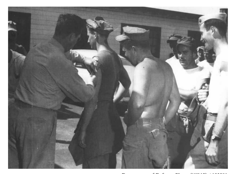
Marines of the wing's forward echelon receive their inoculations in early July at Marine Corps Air Station, El Toro, before leaving for Korea on board the escort carrier Badoeng Strait (CVE 116) and transport General A. E. Anderson (AP 111).