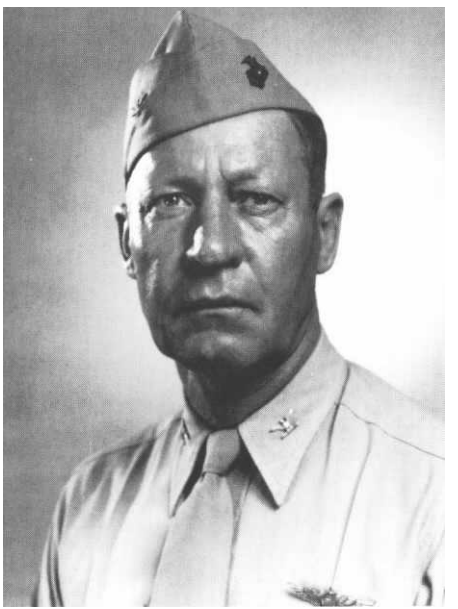
Department of Defense Photo (USMC) A29033 A Marine aviator since 1930 and a veteran of the Guadalcanal, Iwo Jima, and Okinawa campaigns during World War II, Col Frank G. Dailey led the bomb- and napalm-laden Corsairs of Marine Aircraft Group 33 from the Pusan Perimeter to the Chosin Reservoir.

Marine Aircraft Wing, arrived in Tokyo on 3 September, and immediately began to finalize the air support plans for the Inchon operation with Far East Command, the Navy, the Air Force, and the Army. Underlying the air plan was the decision that the sky over the objective area was to be divided between the air units of the Navy's Joint Task Force 7, and those of X Corps. X Corps had been assigned its own organic air under corps control in a manner reminiscent of the Tactical Air Force organization accorded X Army in the Okinawa operation. The command of X Corps tactical air was given to General Cushman who had been the brigade deputy commander to General Craig in the Pusan Perimeter. MAG-33, under Colonel Frank G. Dailey, was designated by the wing as Tactical Air Command X Corps, with principal units being VMFs -212 and -312, in addition to VMF(N)-542 and