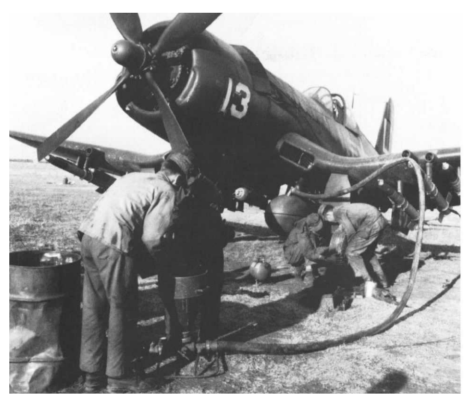
A130420 Speed was of the essence for these Marine airmen in rearming their Corsair for repeated strikes against Chinese and North Korean forces. Ground crewmen in the foreground mix a batch of deadly napalm while other Marines hastily change a tire.

fuel from a tank landing ship, floating clear of the minefield, ashore. In accomplishing the feat, the drums were manhandled into World War II vintage landing craft, now under Japanese operation, using Korean laborers. When close to the beach, the drums had to be manually lifted over the side, as the ramp had been welded shut. Once in the surf the drums were waded ashore through the icy water.