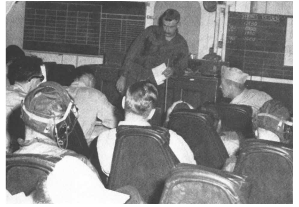
Sicily Highlights from 1946 to 1951

At the time of the commitment to action of the brigade in early August 1950, the United Nations defense had contracted to a perimeter around the southernmost port of Pusan. It was vital that the perimeter contract no more, since the port was the logistic link to a viable base position in support of a United Nations recovery on the peninsula. In bringing this desirable outcome to reality, the brigade became known variously as the "Fire Brigade," the "Marine Minutemen," and other into the breach sobriquets. In the process of their month-in-theperimeter employment, the Marines were accorded the honor of restoring the confidence of United Nations troops through destruction of the myth that the North Koreans were somehow