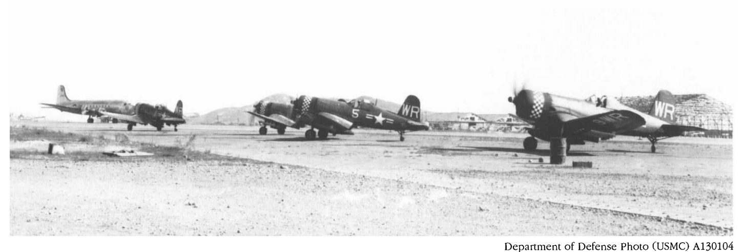
n Kimpo Airfield as clock attacks on retreating North Korean forces.

The Corsairs from VMF-312 take off from Kimpo Airfield as fast as they could be refueled and rearmed in around-the-