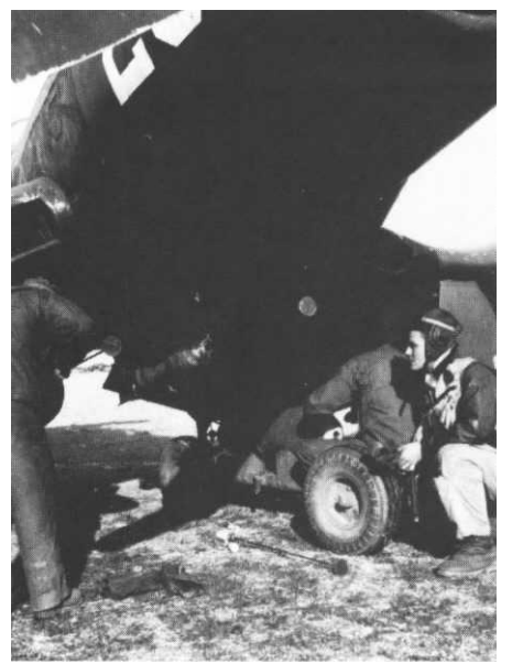
Marines who used the "daisy-cutter" in the South Pacific rig them again for use against the Chinese in Korea. Attaching the bombs to the racks of the Corsair required delicate adjustments, often difficult in the sub-zero Korean winter weather.

On the morning of the 27th, the division began its attack from Yudam-ni on schedule but the lead regiment had only advanced about 2,000 yards when stiff resistance stopped it. On the night of the 27th, the CCF in great strength attacked all Marine positions from Yudam-ni to Koto-ri, including a division attack on Company F at Toktong Pass, and a strong assault of division-sized against the threebattalion task force of the 7th Infantry Division east of the reservoir. As the intelligence reports