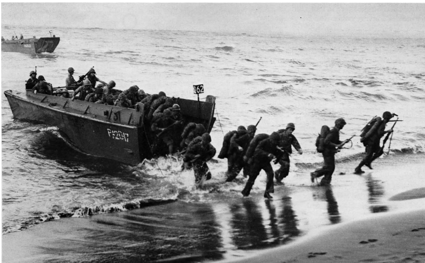
On 1 November 1943 Marines charge ashore on Bougainville, the operation under the commander of the I Marine Amphibious Corps. I MAC became the III Amphibious Corps, a part of Expeditionary Troops under LtGen Holland M. Smith, in 1944.

During the year 1962, the issuance of the Marine Corps Expeditionary Medal was twice authorized, being awarded to the Marine defenders of the U.S. Naval Base at Guantanamo during the Cuban Missile Crisis (3 January 1961-23 October 1962) and to the 3d Marine Expedition-