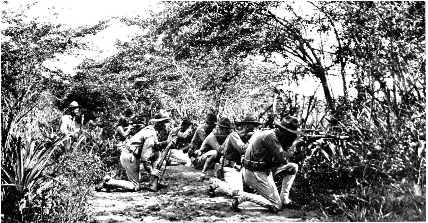
Marines of the 8th Company, 4th Marine Regiment, West Coast Expeditionary Force, form a skirmish line near Santiago in the Dominican Republic in June 1916. In 1922, the Advance Base Expeditionary Force at Quantico became the East Coast Expeditionary Force.