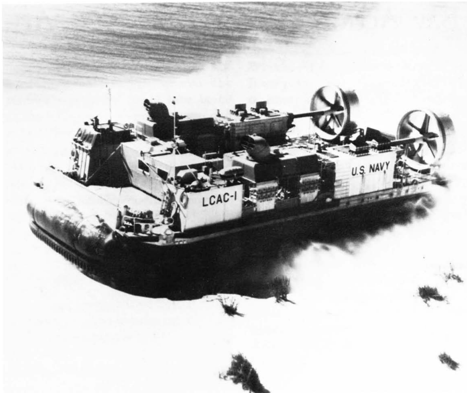
The Landing Craft, Air Cushion (LCAC-1) made its debut on foreign soil in a Marine landing, part of Exercise Valiant Usher '87, held in Western Australia in September.