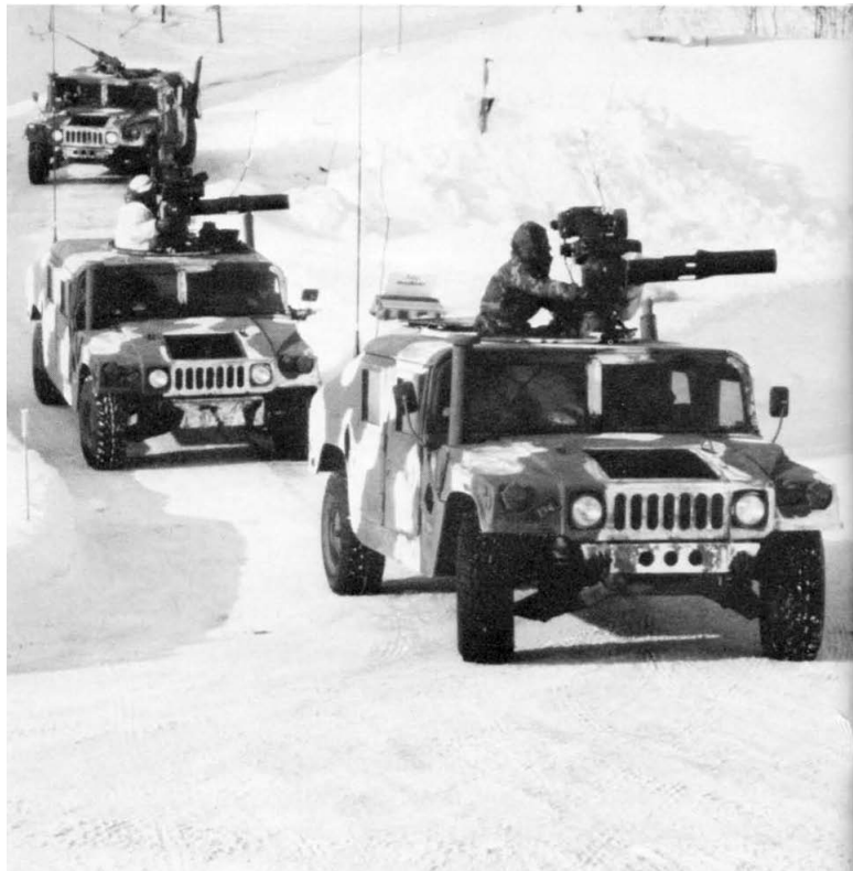
In March, 4th MAB joined in Exercise Cold Winter '87.