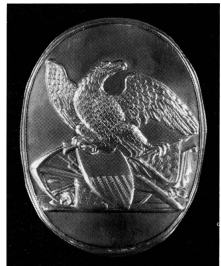
1840 Shoulder-belt Plate