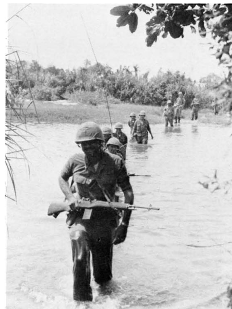
Men of 2d Battalion, 3d Marines, maneuver near Da Nang on 6 May 1965. Next day the III Marine Expeditionary Force became the III Marine Amphibious Force.

The Chu Lai landing was on 7 May. The day before the landing the headquarters of the 9th MEB at Da Nang was deactivated, becoming the cadre for the headquarters of the III Marine Expeditionary Force, which was to absorb both brigades. Alarm bells went off in the Saigon headquarters of the U.S. Military Assistance Command, Vietnam. ComUSMACV, Gen William Westmoreland, got off a message to the Joint Chiefs of Staff urging a unit designation less likely to upset Vietnamese sensibilities. Unit designations are, of course, a service prerogative and the Joint Chiefs asked Gen Wallace M. Greene, then the Commandant, to come up with