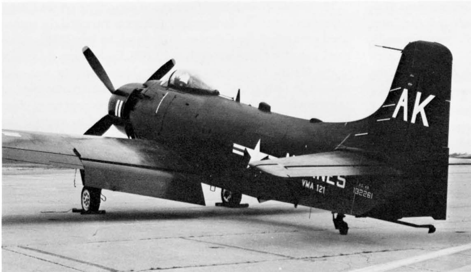
This AD-4B (BuNo. 132261) is undergoing rework at the Air-Ground Museum, Quantico. The incorrect VMA-121 markings were on the aircraft when it was procured.