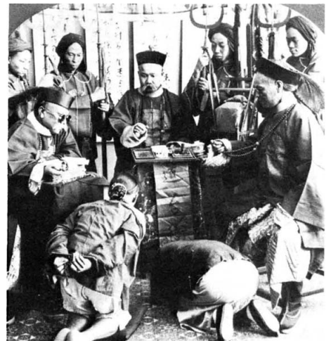
Chinese court passes sentence on Boxer prisoners. The surrender treaty demanded the Chinese themselves punish the Boxers.