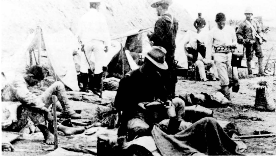
Doctors of various nationalities combine to treat the wounded during the battle of Tientsin on 13 July 1900. In the foreground an American surgeon pours water for a wounded Japanese infantryman. Marine casualties totaled five killed and 23 wounded.

mous "International Gun." A scale-model of the American Legation in Peking was built—building by building—by SSgt Michael V. Gaither from contemporary blueprints and photographs, and painstakingly painted to mirror reality.