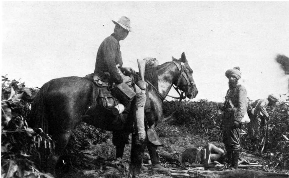
On 5 August 1900, mounted American member of the China Relief Expedition surveys British Indian Army position where a wounded Indian is being placed on a stretcher before receiving treatment. The relief column had 10 more days before reaching Peking.

Springfield .45-caliber single shot rifle, the Winchester-Hotchkiss rifle, the Lee Straight-Pull rifle, and the new Krag Jorgensen rifle. Marines on board the ships which had been on the Asiatic Station for years, still had not been supplied modern arms. Marines sent directly from the United States carried the most modern arms in the American military arsenal, the Krag-Jorgensens. According to personal narratives of Marines in the field, a supply nightmare was avoided by discarding the antiquated weapons and using captured modern Chinese rifles, for which there was plenty of ammunition.