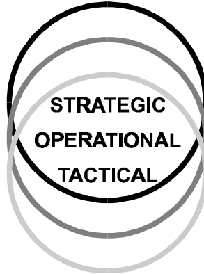
Figure 2. The Levels of War Compressed.

All actions in war, regardless of the level, are based upon either taking the initiative or reacting in response to the opponent. By taking the initiative, we dictate the terms of the conflict and force the enemy to meet us on our terms. The initiative allows us to pursue some positive aim even if only to preempt an enemy initiative. It is through the initiative that we seek to impose our will on the enemy. The initiative is clearly the preferred form of action because only through the initiative can we ultimately impose our will on the enemy. At least one party to a conflict must take the initiative for without the desire to impose upon the other, there would be no conflict. The second party to a conflict must respond for without the desire to resist, there again would be no conflict.