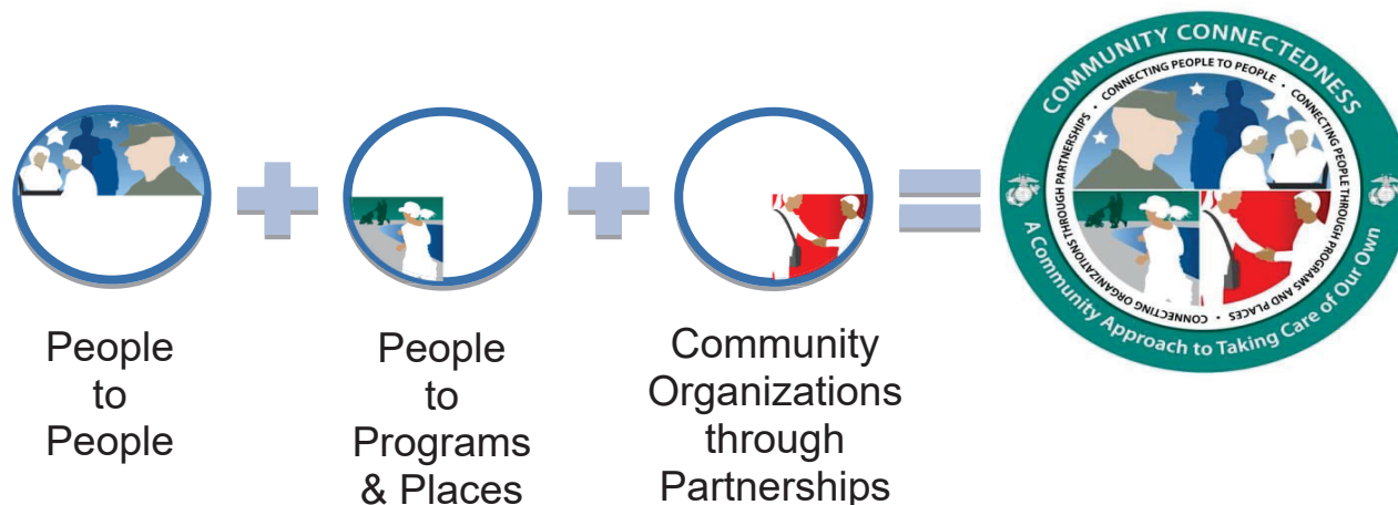
Figure 1-1.--Community Connectedness Model

9. Recreation Inclusion . MCCS is committed to providing recreation programs that support the needs of all patrons. As required by reference (c), nondiscrimination on the basis of handicap in programs and activities assisted or conducted by the Department of Defense. MCCS Recreation Programs shall make reasonable accommodations to their local policies and practices to accommodate patrons with disabilities into their programs. No qualified individual with a disability shall, on the basis of disability, be excluded from participation in or be denied the benefits of Marine Corps Recreation Program services or activities of a public entity, or be subjected to discrimination by recreation programs or staff.