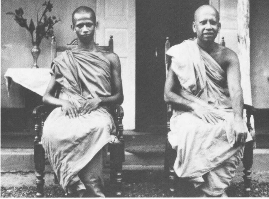
Like father, like son: two generations of Buddhist monks

into “families”: the Siyam Nikaya contained six divisions; the Amarapura Nikaya, twenty-three; and the Ramanna Nikaya, two. Each family maintained its own line of ordination traced back to great teachers and ultimately to the Buddha. Caste determined membership in many of the sects.