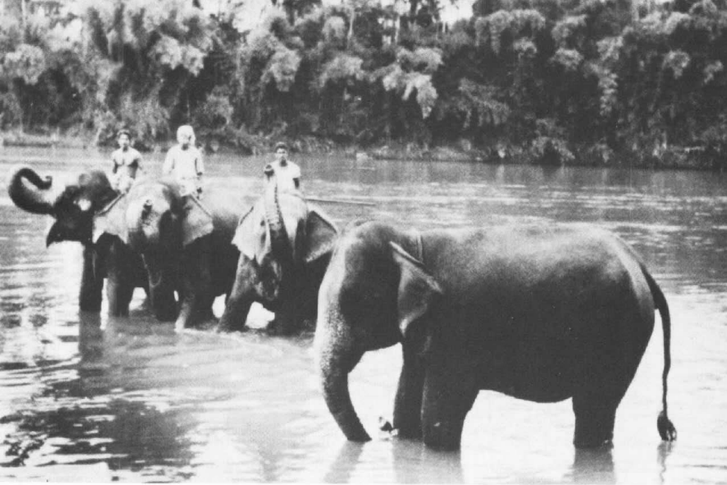
Elephants bathing in a jungle river

strong among the Vellala and other high castes. Major changes have occurred, however, in the twentieth century. Ideas of equality among all people, officially promoted by the government, have combined with higher levels of education among the Tamil elites to soften the old prejudices against the lowest castes. Organizations of low-caste workers have engaged in successful militant struggles to open up employment, education, and Hindu temples for all groups, including former untouchables.