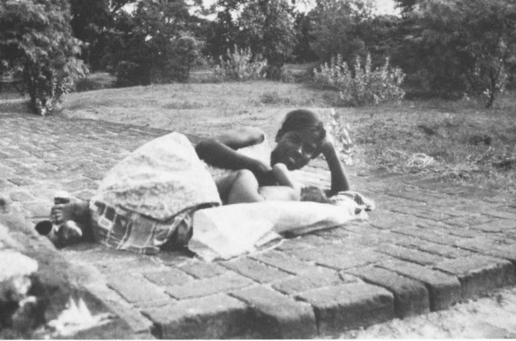
Tamil woman and child

marriage alliances, and many middle-class women withdraw from the workplace after marriage.