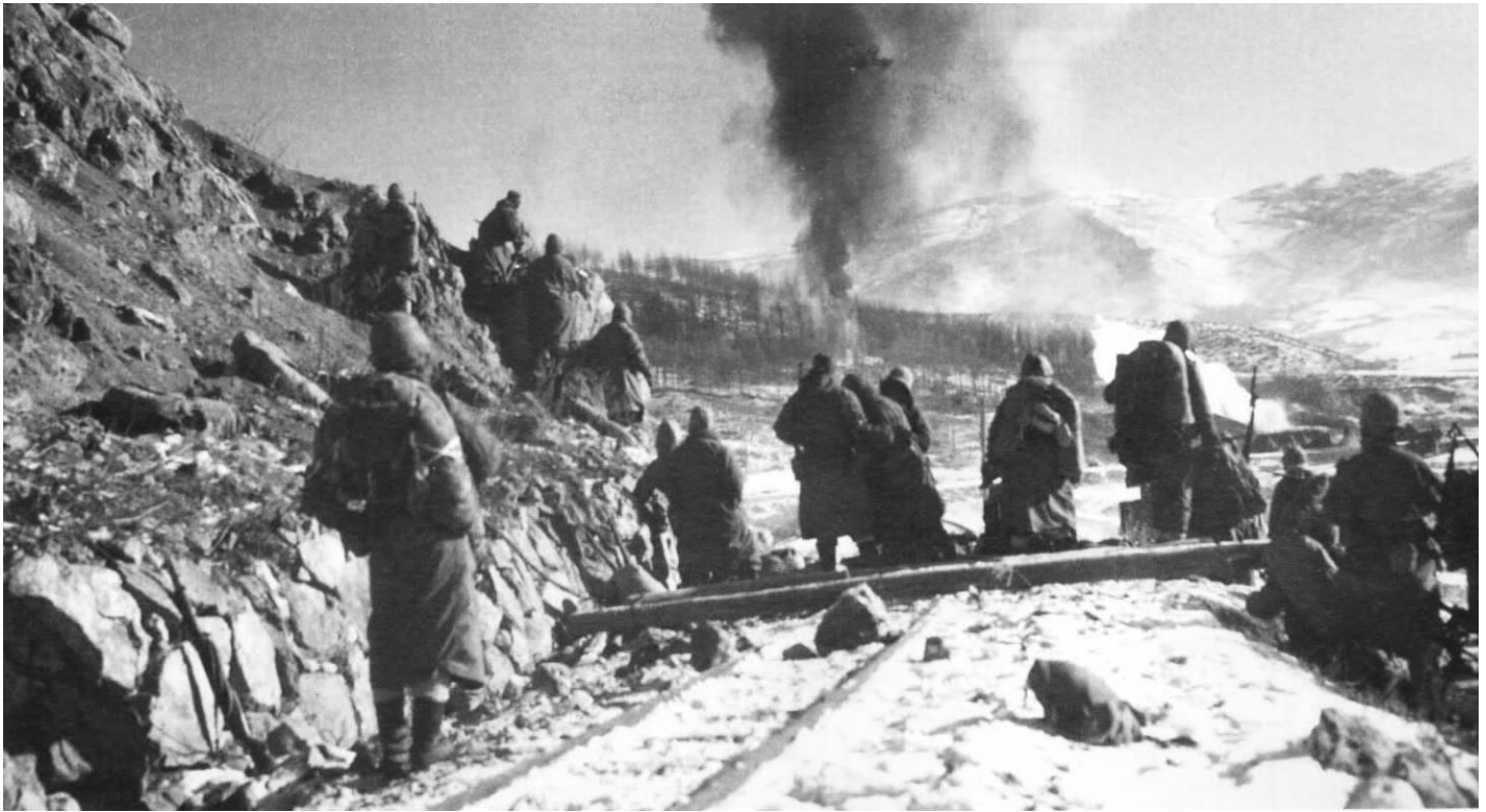
Col Litzenberg's 7th Marines led off the march south from Hagaru-ri on 6 December. Here one of his units pauses at the roadblock held by Weapons Company, 3d Battalion, 1st