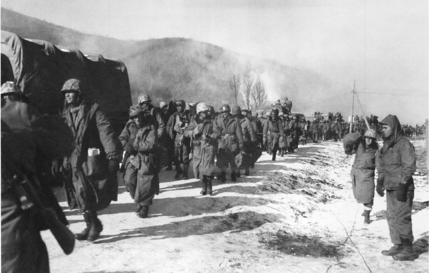
Marines depart Yudam-ni on 1 December. The general plan for the breakout was that the 5th Marines would follow the axis of the MSR and the 7th Marines would move overland.