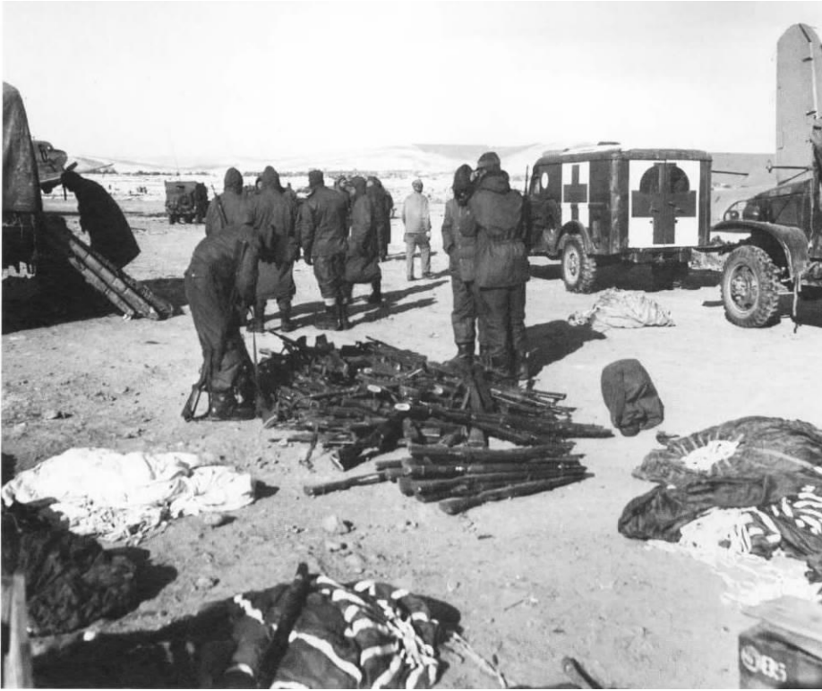
Photo by Sgt William R. Keating, Department of Defense Photo (USMC) A5683 Casualty evacuation from Hagaru-ri airstrip began on 1 December, although the condition of the field fell far short of what safety regulations required. Here, on a subsequent day, an ambulance discharges its cargo directly into an Air Force C-47 or Marine Corps R-4D transport. Weapons of other, walking wounded, casualties form a pile in the foreground.

Hagaru-ri was already stockpiled with six days of rations and two days of ammunition. The first airdrop from Air Force C-119 "Flying Box Cars" flying from Japan was on that same critical 1st of December. The drops, called "Baldwins," delivered prearranged quantities of ammunition, rations, and medical supplies. Some drops were by parachute, some by free fall. The Combat Cargo Command of the Far East Air Forces at first estimated that it could deliver only 70 tons of supply a day, enough perhaps for a regimental combat team, but not a division. By what became a steady stream of transports landing on the strip and air drops elsewhere the Air Force drove its deliveries up to a 100 tons a day.