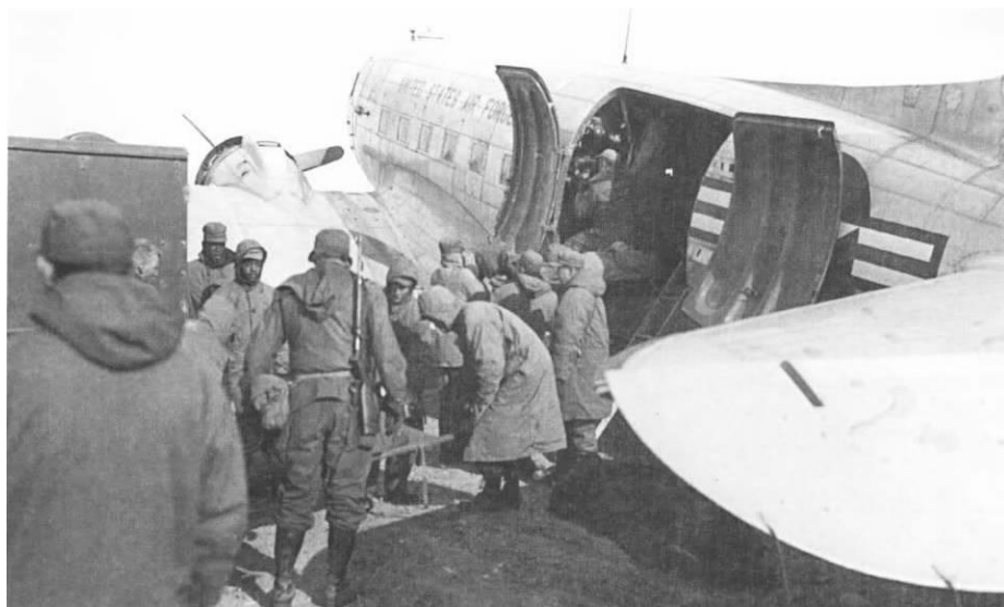
National Archives Photo (USMC) 127-N-A4909

Aerial evacuation of wounded and severely frostbitten Marines and soldiers from Hagaru-ri saved many lives. During the first five days of December, 4,312 men—3,150 Marines, 1,137 soldiers, and 25 Royal Marines—were air evacuated by Air Force and Marine transports that also brought in supplies and replacements.