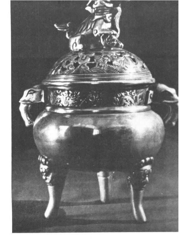
Seventeenth-century incense burner

this way, the Russians had reached the Amur Valley and the Pacific Ocean by mid-century. In the period between 1641 and 1652, the Russians gradually conquered the Buryat Mongols, thereby gaining control of the region around Lake Baykal. The Manchus observed with considerable apprehension Russia's growing pressure on the Turkic peoples and the Mongols of Inner Asia. As early as 1653, there were clashes between Manchus and Russians in the Amur Valley. In 1660 the Manchus ejected the Russians from the Amur region, only to see them reappear when the Manchus became occupied with internal troubles in southern China.