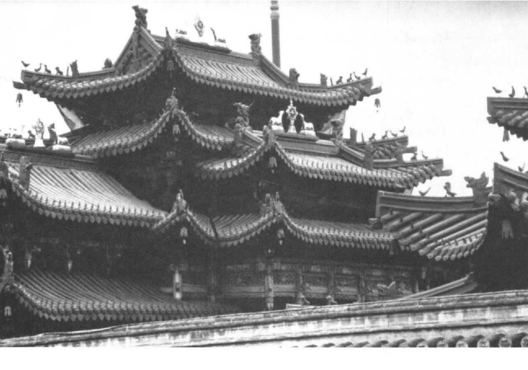
The Bogdo Khan's palace, now a museum, Ulaanbaatar

formalization of Mongolian-Soviet relations then was accelerated. On November 5, 1921, a bilateral Agreement on Mutual Recognition and Friendly Relations was signed in Moscow. It recognized the People's Government of Mongolia, and it facilitated the exchange of diplomatic representatives. Furthermore, it provided for the self-determination of Tannu Tuva (see Glossary), a region in northwestern Mongolia that had been a Russian protectorate between 1914 and 1917.