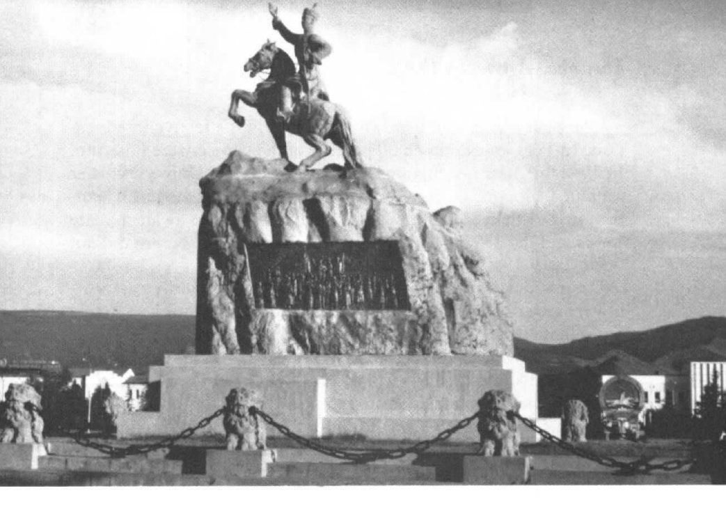
Monument to Sukhe Bator, Ulaanbaatar

and military aid. In 1936 military expenditures were doubled, and by 1938 more than half of Mongolia's budget was for defense. The government built paved roads, extended railroads, and established military air bases and communication lines, all with Soviet aid. Military equipment and training also were supplied by the Soviet Union. It is estimated that during World War II the Mongolian Army numbered between 80,000 and 100,000 troops, a huge percentage of the total population of 900,000.