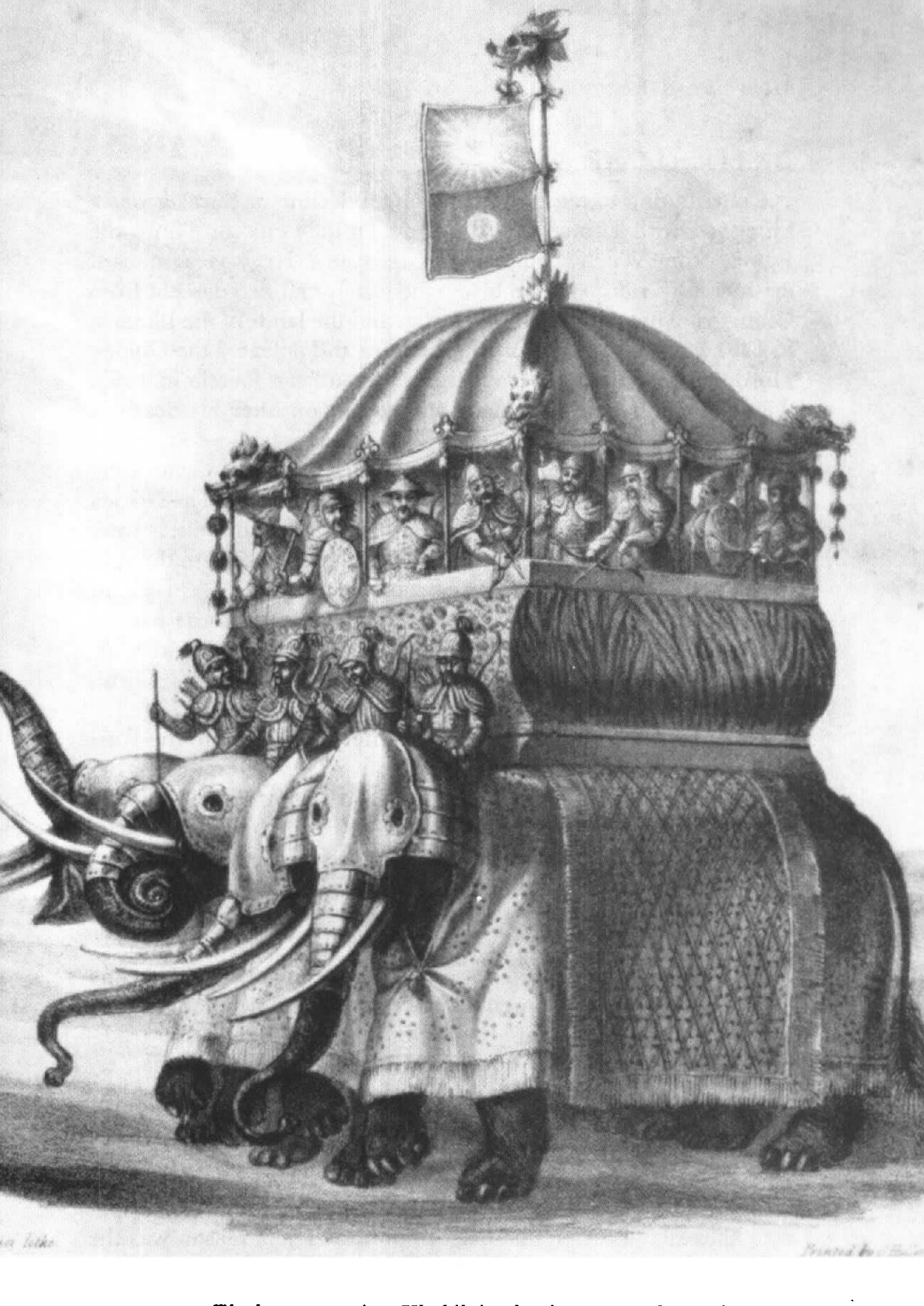
Elephants carrying Khubilai Khan's command post in battle