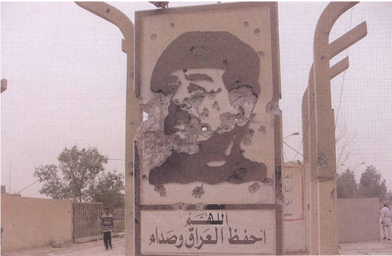
Murals of Saddam were defaced by Iraqis across the city.

and no Regime figures left in Baghdad to protect, the Republican Guard and Special Republican Guard troops had no reason to stay and fight. There was nobody left with enough authority to actually surrender. Centralized control had broken down, and all the pieces remaining were acting in self-interest in a bid for their own survival.