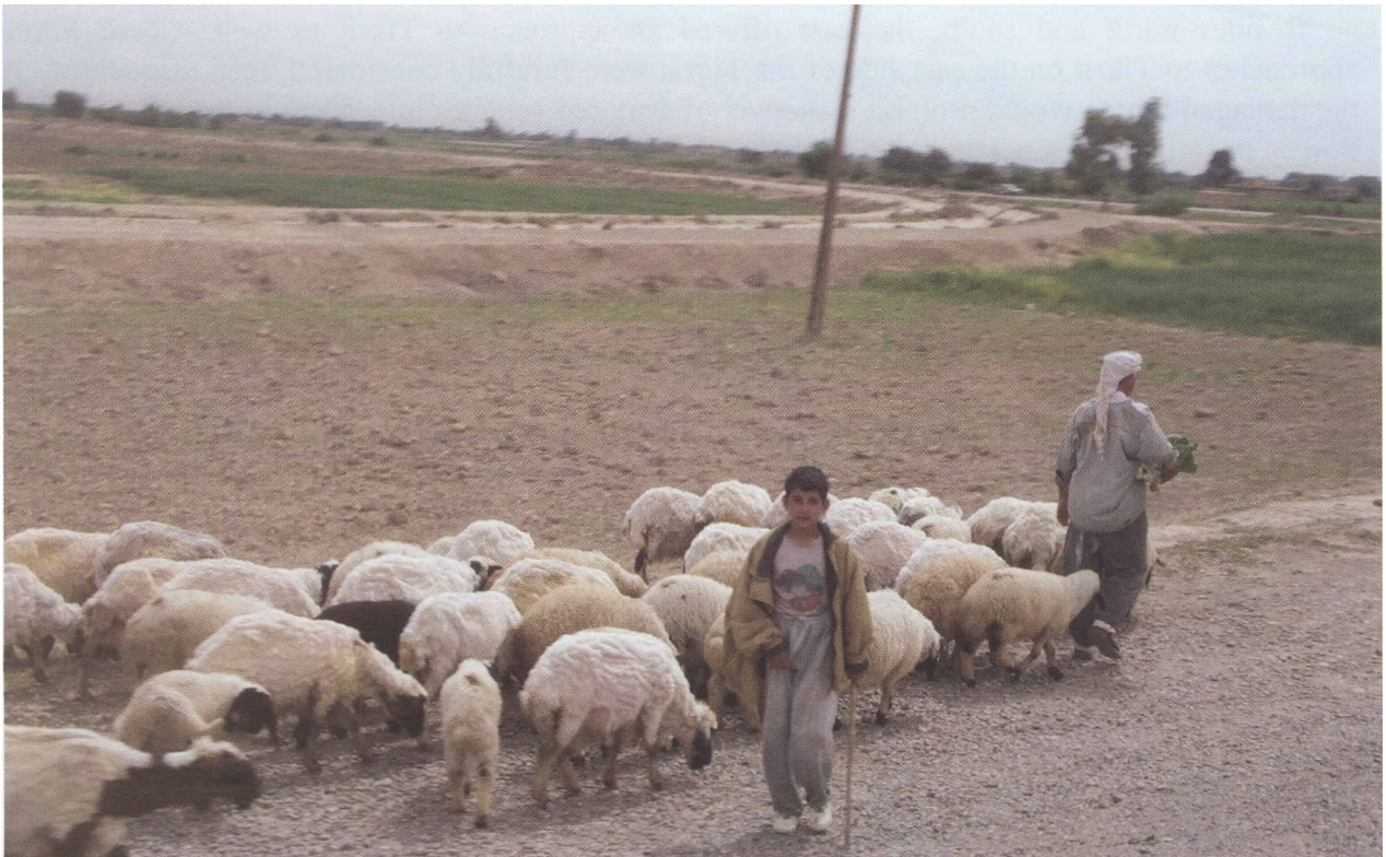
Despite an invasion and a ground war, Iraqi civilians attempted to carry on with their normal daily activities. The Iraqi people were reassured that there was "No Better Friend" than a United States Marine.

Once across the Tigris, Tripoli would conduct a rapid night march up Highway 1 to just outside Samarra. Samarra lies on the east side of the Tigris, with a bridge connecting it to the Highway on the western bank of the river. There had been some threats noted from the Samarra area, but the enemy disposition there was largely unknown. At Samarra, the 3 d LAR 'Wolfpack', under Lieutenant Colonel Stacy Clardy, would be left to establish a blocking position near the bridge, while the rest of the Task Force bypassed the city on the west side. Thirty kilometers up the road, 2 d LAR's 'Barbarians', under Lieutenant Colonel Ed Ray, would use a Tikrit highway bypass to establish a blocking position to the north of the city. Once the northern exit had been blocked, the 1 st LAR 'Highlanders', under Lieutenant Colonel Duffy White, with a motorized infantry company (G/2/23) attached, would attack into the city. As the Highlanders pushed up, they would clear the southern Tikrit Airfield for the CSS element that was following in trace. CSSC Tripoli, under Major Mike Callanan, would establish the airfield as a logistics base for ground operations and a FARP in support of continued air operations. A