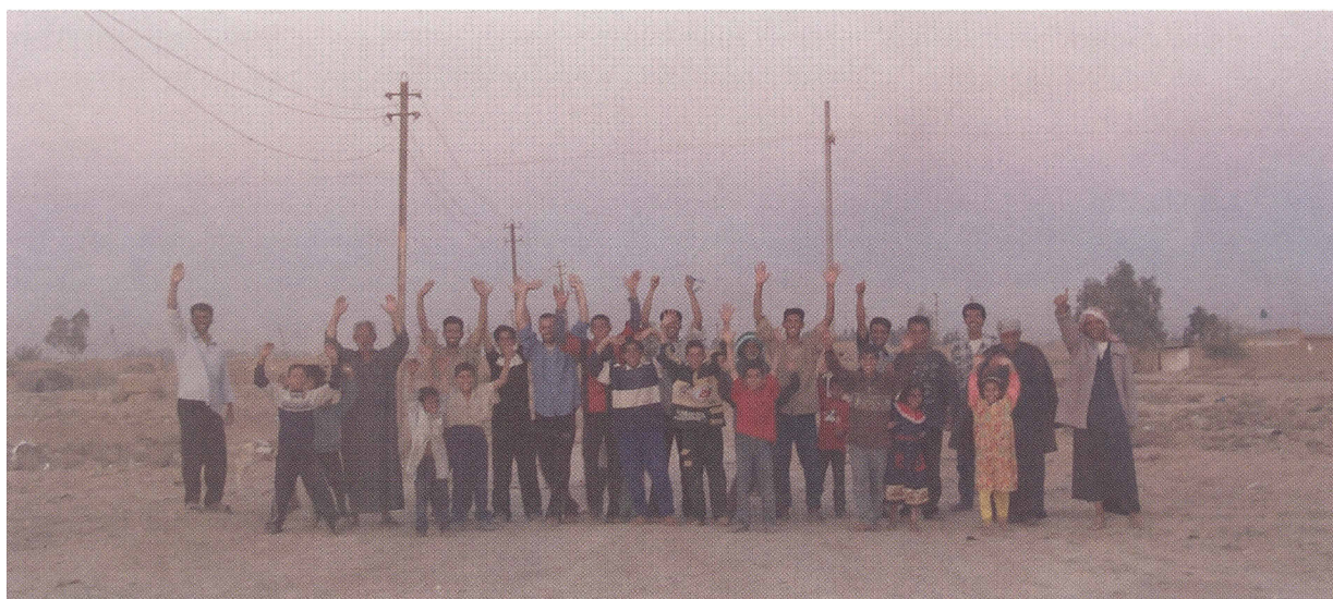
Iraqis in Al Swash welcome the Marines.

Tripoli launched its attack during the afternoon hours of 12 April. As the sun was going down, Task Force Tripoli approached the Al Swash bridge over the Tigris River, the same bridge that G/2/5 had fought its way across only hours previously. It was a very long but narrow bridge, with steep approaches on both banks. The approach to the bridge and passage through the small village of Al-Swash along the Tigris River was a surreal experience that none of the members of the Task Force would forget. The long columns of Task Force vehicles snaked through the tiny village, in many places squeezing between houses with barely room to spare on either side. The village had electricity, and in the dimly lit streets, houses, and cafes, the population turned out to welcome the Marines and wish them good luck. Many in the cheering crowd passed out candied dates and cold soda. Families with children lined every doorway and sidewalk, shouting "Hello", "George Bush good", and "What is your name?" The same phrases had been heard throughout the operation from An Nasiriyah to Baghdad, but in the surreal quiet of this recently liberated village along the Tigris, the words seemed to be shouted with a special enthusiasm. The local citizens had seen the reaction of the Marines to the presence of the enemy, and they rejoiced that the Regime fighters on the far shore had been forced to flee.