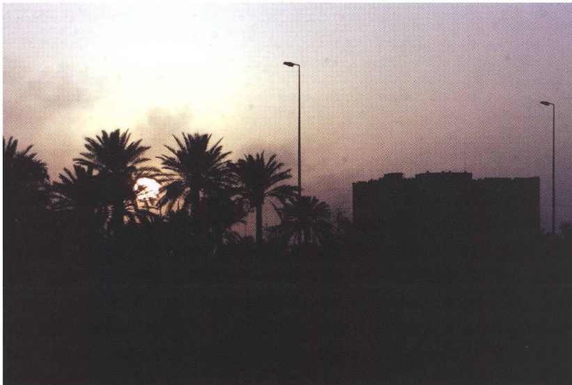
The sun sets on another challenging day in Iraq.

objectives would have to be redone. The timeline for the mission, however, was to remain the same. The Division had less than 12 hours to assemble the plan, and would be expected to LD no later than 12 April. Having proven its ability to produce a mission plan for an attack of this magnitude in 24 hours, the Division proved its ability to do it again in only 12 hours. The entire process that had been completed in support of the Kirkuk mission was repeated for Tikrit, only in less time. The changed battlespace and enemy situation demanded a renewed analysis. The G-2 went to work immediately, and was still assembling target lists when the task force rolled up to the gates of Tikrit less than 48 hours later. Task Force Tripoli was born in the saddle, and would soon be riding to its first objectives.