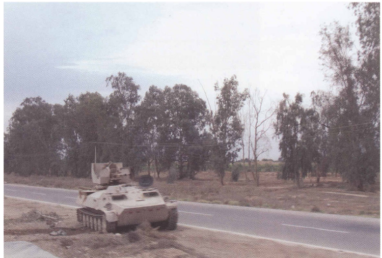
Abandoned vehicle on the Highway 1 approach to Tikrit.

The restricted approaches were the cause of hours of delay, and Tripoli was well behind schedule when it finally cleared the Tigris. The decision was made to continue to press through the night all the way to Tikrit. The lead elements of the Task Force pushed out onto the hard surface road and immediately picked up speed. After the excitement of passing through the village, the drivers now had to stay up all night in a fast approach to Tikrit, denying the enemy a chance to react.