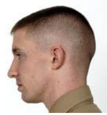
Figure 1-4.--ISO-PREP Photograph Standards