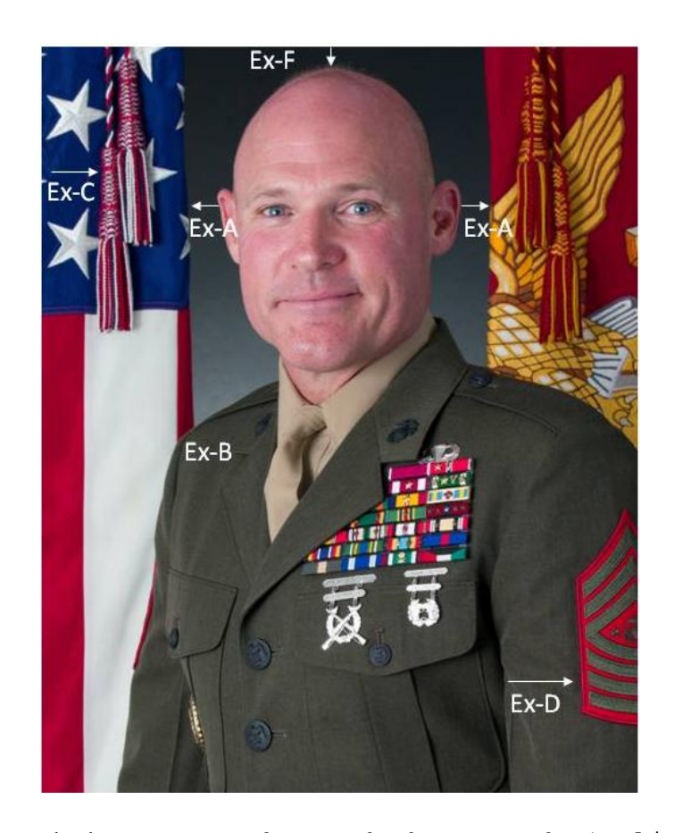
Figure 1-1.--Command Board Photograph (enlisted)