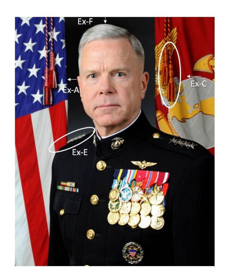
Figure 1-2.--Command Board Photograph (officer)