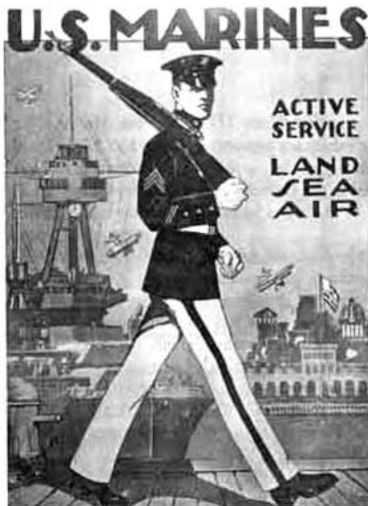
Second model "Walking John" 1939