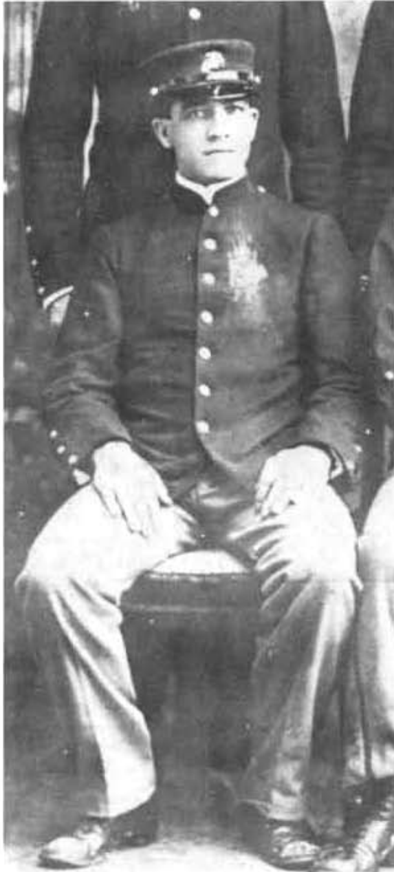
Pvt Dan Daly, photographed at M. Mumeya Studio, Hong Kong, March 1900.