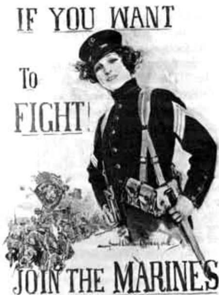
Howard Chandler Christy's popular "Honey Girl" poster