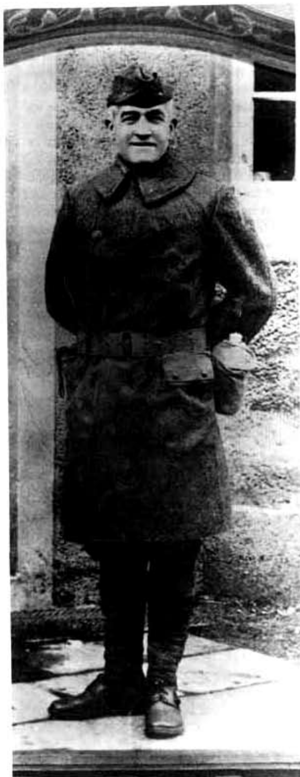
1st Sgt Dan Daly standing outside billet in France, 1918.

Dan Daly was truly a legend in his own time. John Lejeune called him "... the outstanding Marine of all time," while Smedley Butler said he was "the fightinest Marine I ever knew ... it was an object lesson to have served with him." That legend's medals are on display at the Marine Corps Historical Center.