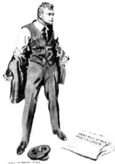
Early World War I poster from the prolific brush and vivid imagination of James Montgomery Flagg