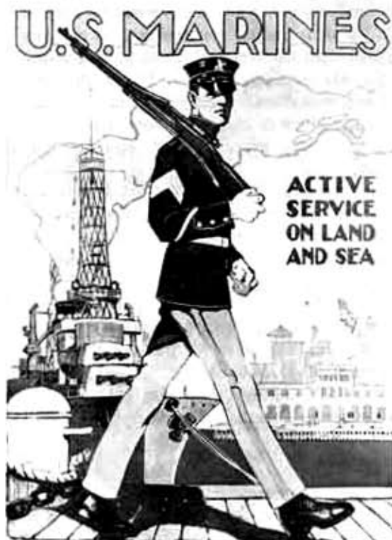
First model "Walking John" - 1917