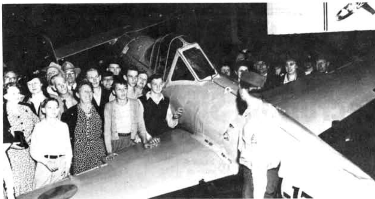
The "real" I-13 on board LST 512 in 1946. This Baka bomb, photographed earlier on Okinawa, served as the markings model for the Baka on display at the Marine Corps Aviation Museum at Quantico.