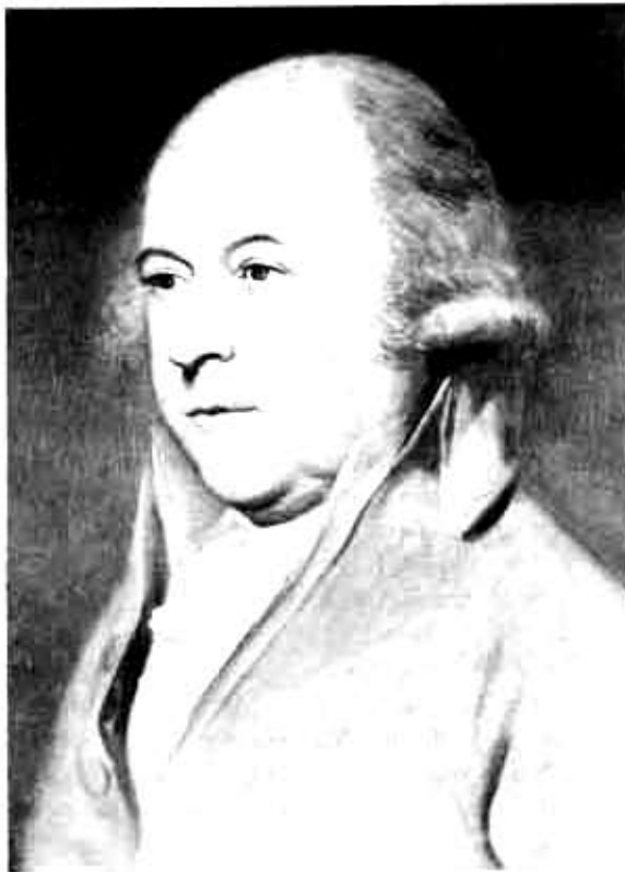
John Adams. Painting by Charles Willson Peale.

Congressman James A. Burke of Massachusetts was the author of the simple two-clause resolution (J. H. Res 1002): "Whereas John Adams was instrumental in the establishment of a Marine Corps by the Second Continental Congress in 1775; and Whereas John Adams as the second President of the United States signed into law the Act of July 11, 1798, which established the United States Marine Corps: Now therefore be it Resolved that he shall be known as the Father of the United States Marine Corps."