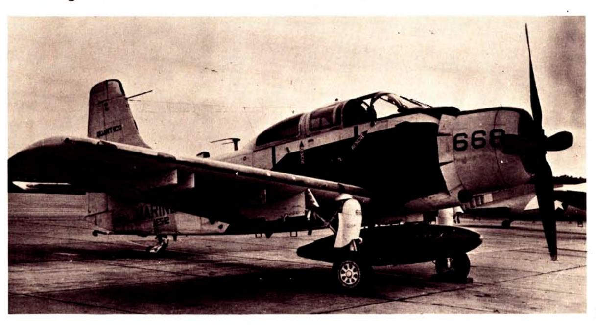
Douglas AD-5 Recently Added to the Aviation Collection.

The FH-1 was the first jet to enter squadron service with Marine aviation and the particular specimen acquired was one of the earliest machines accepted by the Corps. Just prior to its acquisition by the Museum it was used as a jet trainer for a commercial flying school.